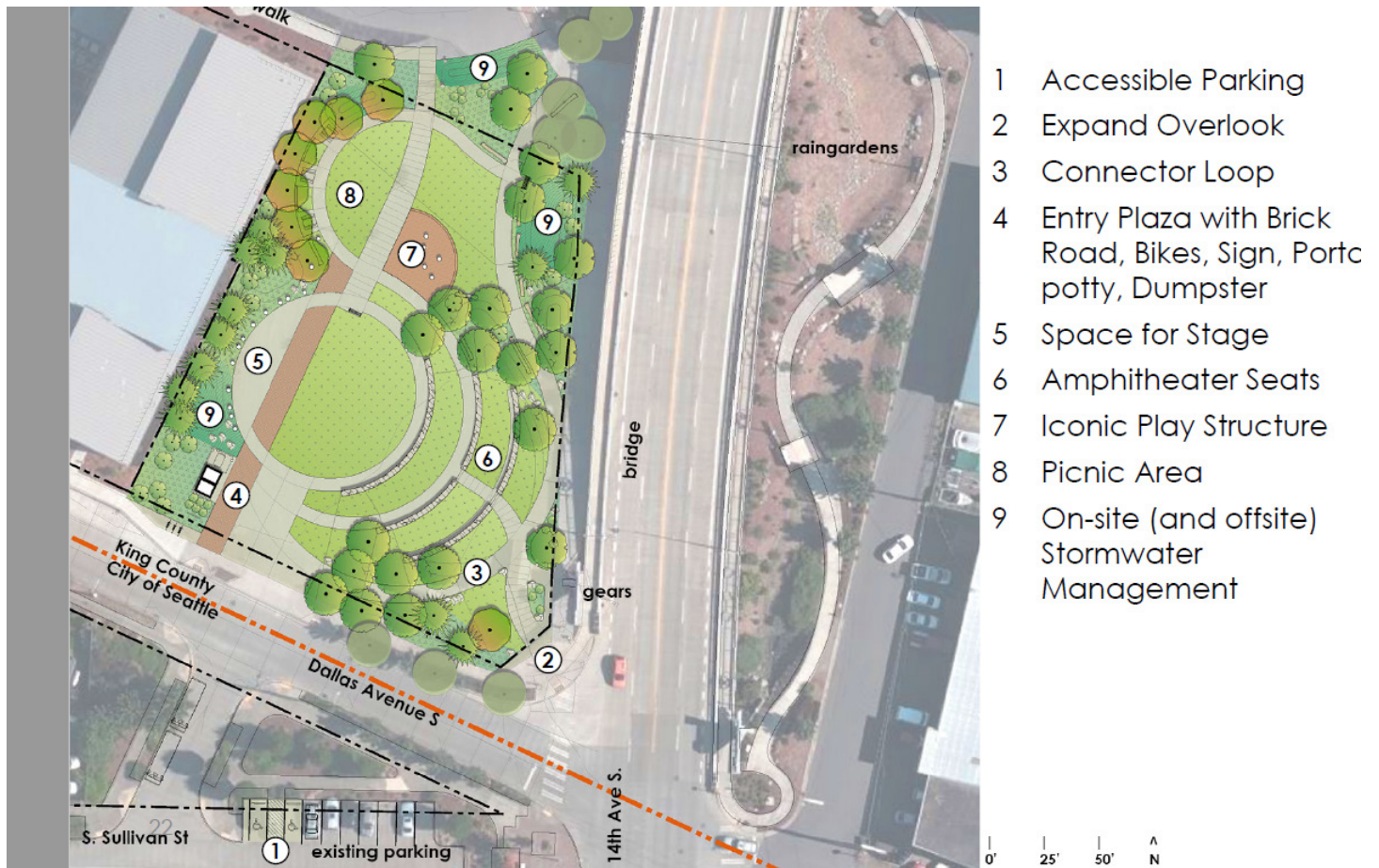
Figure 2: Updated design proposal