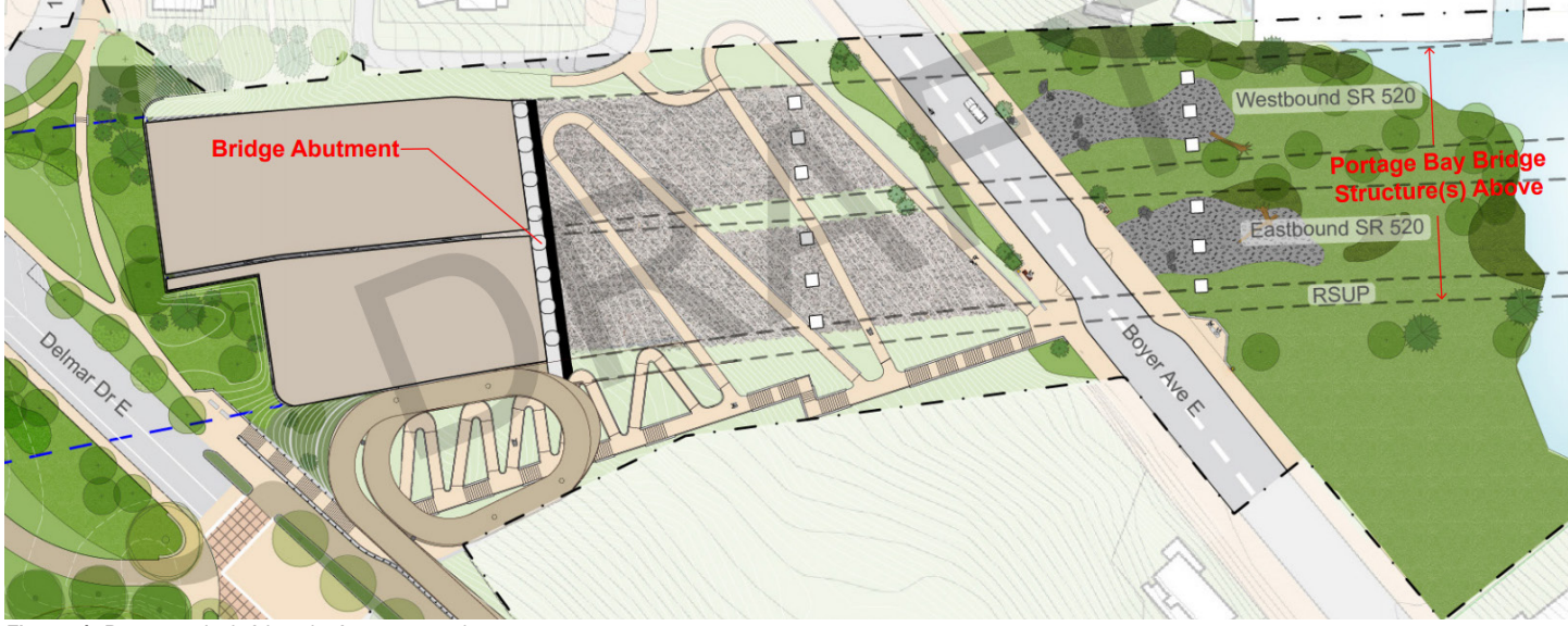
Figure 4: Boyer underbridge design proposal