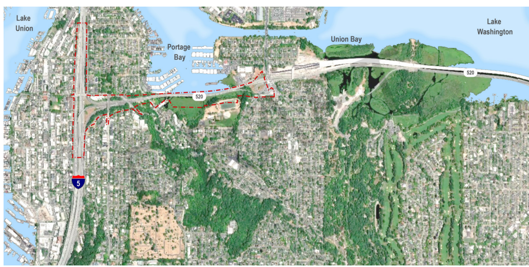
Figure 1: Project location