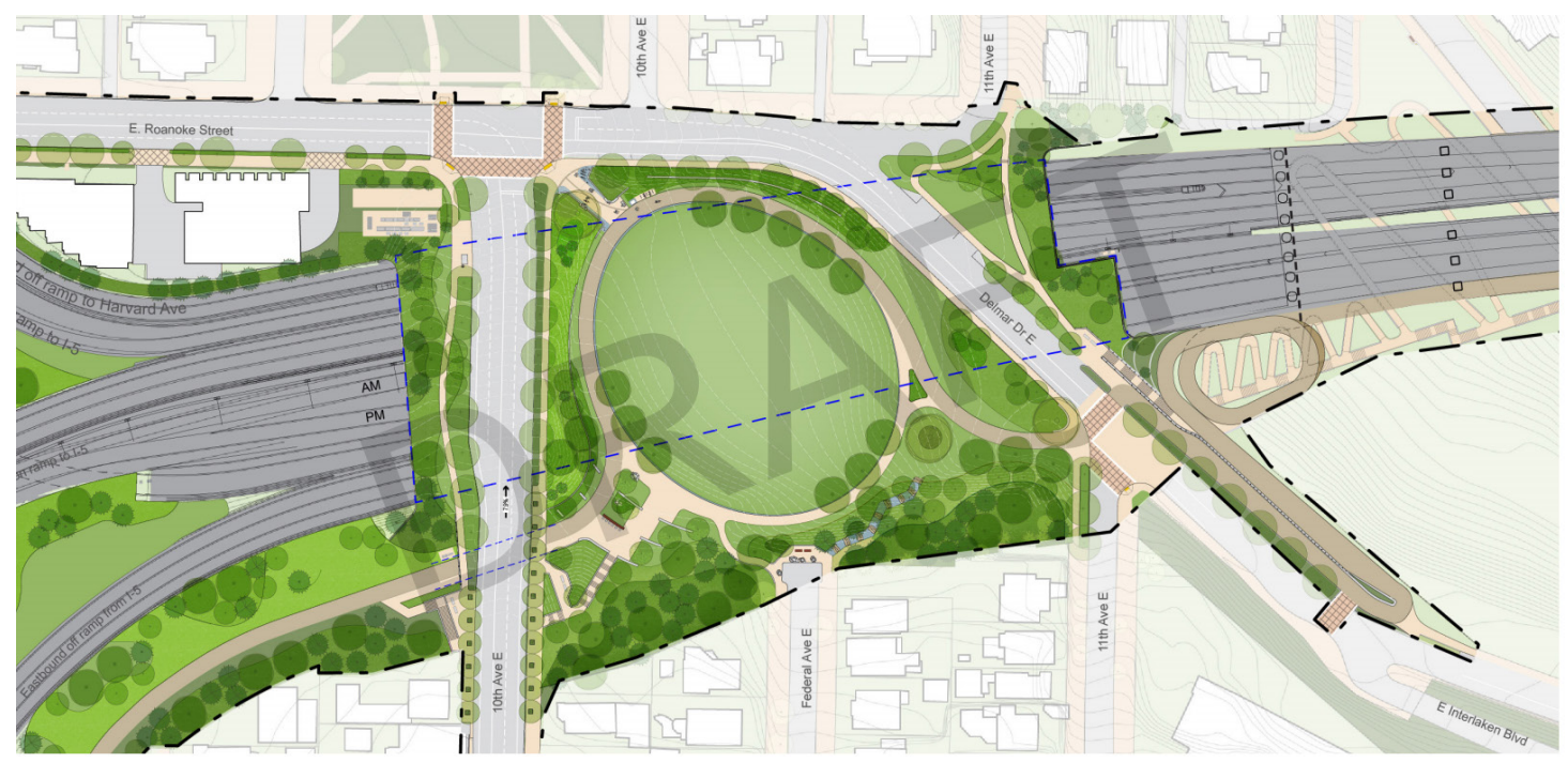
Figure 5: Roanoke Lid design proposal

a central lawn area, mature trees and other vegetation. A shared use pathway will wrap around the northern portion of the central open space. The proposed lid design will also provide connections between the central open space and Delmar Dr, Federal Ave E, 10th Ave E, and E Roanoke St. The northwest and southwest corners of the central lid space along 10th Ave E are identified as neighborhood gateways and will include design features such as unique park sign, bike racks and parking area, drinking fountain, special paving, seating, and gathering space. Several overlooks are located on the southern portion of the lid near 10th Ave E and at the Federal Ave E street end and will include seating, special paving, and lean rails. The proposed planting framework will be used to transition from on space to another as well as restoring and enhancing habitat functions along the shoreline, wetlands, steep slopes. See figure 5 for more detail .