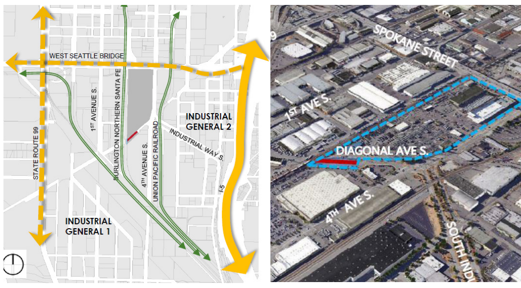
Image 1: Project location (highlighted in dark gray & red on left and blue & red on right)