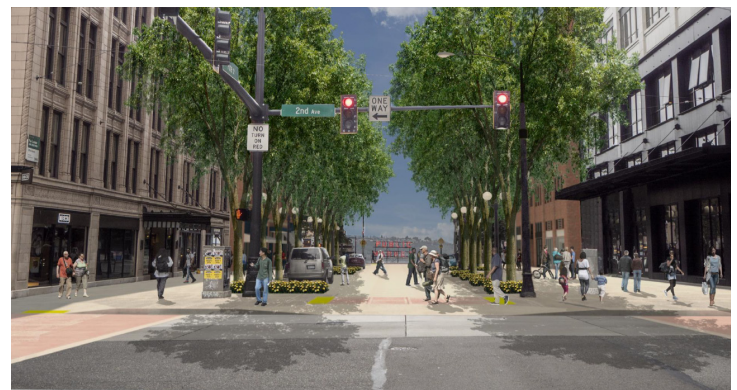
Image 3: Design proposal between 1st Ave & 2nd Ave along Pike St (left) and Pine St (right)