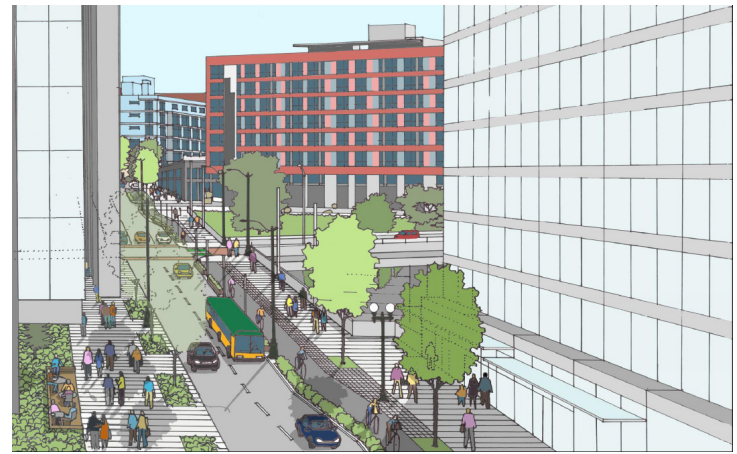
Image 4: Design proposal in East Focus Area along Pike St (left) and Pine St (right)