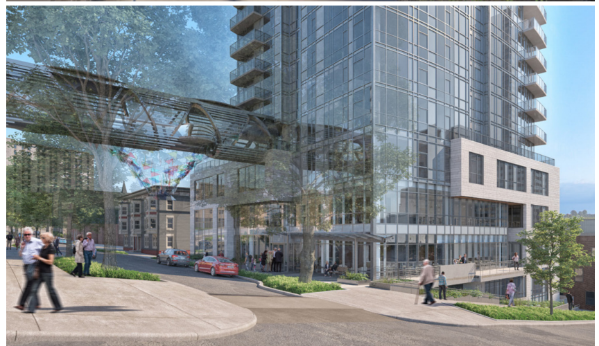
Figure 3: Renderings of proposed skybridge design and art

Amy Gray , SDOT, provided a quick overview of what the Seattle Municipal Code requires the department to look at. Ms. Gray then focused on one criteria which addresses feasible alternatives to the skybridge proposal. Ms. Gray stated that if there are no feasible alternatives then the skybridge can proceed, but that SDOT believes there are feasible alternatives. Ms. Gray then reminded everyone that the department reviews feasible alternatives regardless of the design of the proposed skybridge.