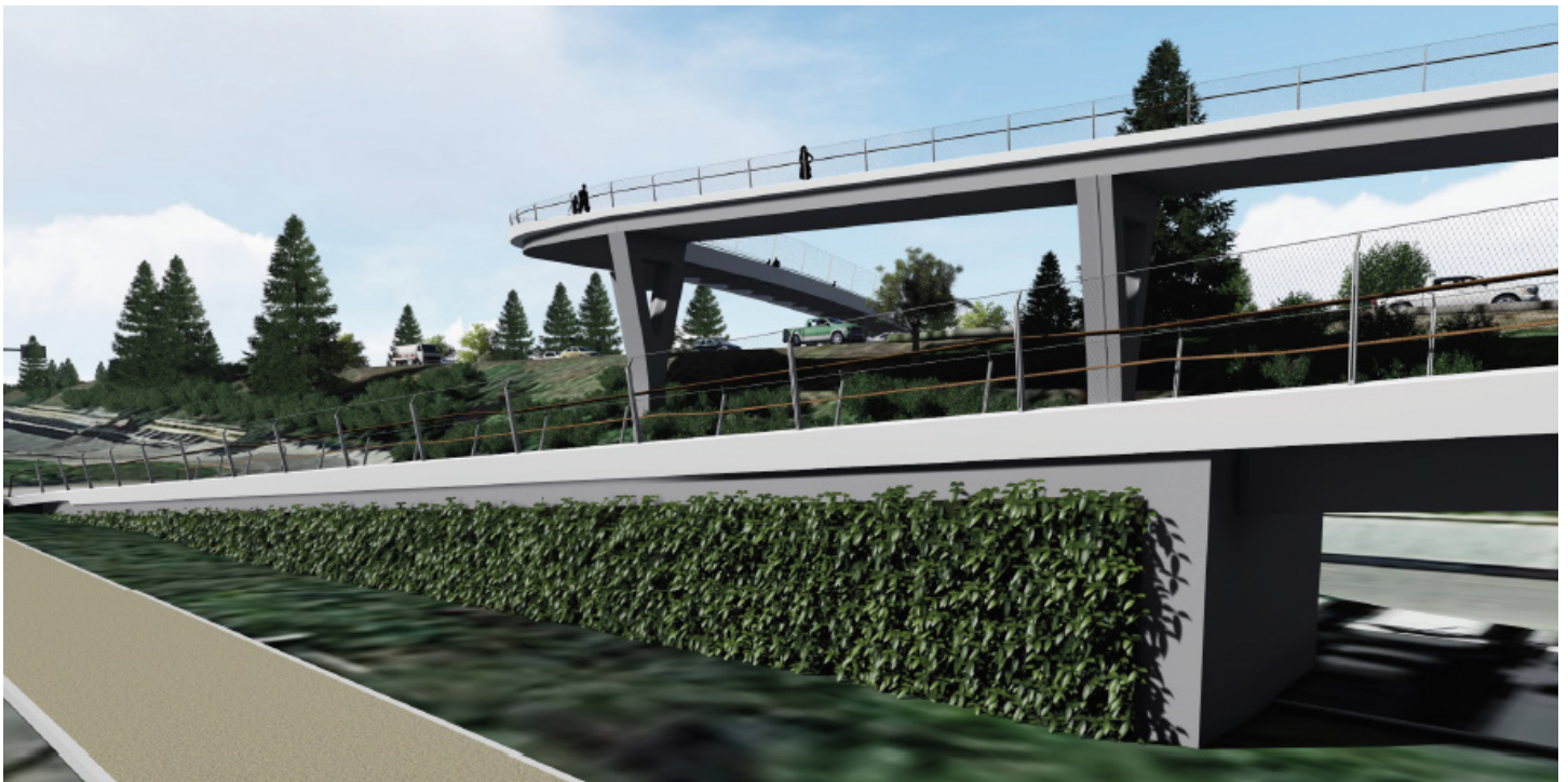
Figure 4. Geofore wall

The bridge will terminate at the intersection of NE 100th St and 1st Ave NE on the east end and to the west at North Seattle College's eastern parking lots. There are at-grade landings on both ends of the bridge, providing potential pedestrian and bicyclist mixing zones. An additional connection is proposed at the mezzanine level of Northgate Station. The updated design eliminates the need to obtain the WSDOT parking lot at NE 100th and 1st Ave NE for the ramping system. The design includes an 8.3% slope on the west and east approach in order to accommodate the at-grade connection and direct pedestrian access. The updated design also includes a geofore wall, 240 feet in length, along the west approach. The proposed wall will include a textured concrete finish with vining plants attached.