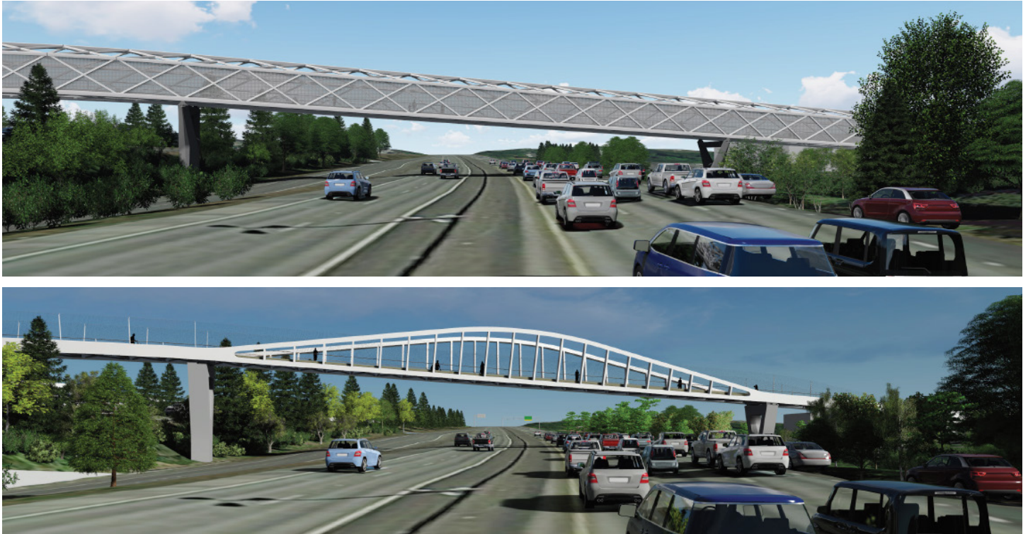
Figure 3. Initial tube truss design across I5 compared to revised open truss design

The bridge will terminate at the intersection of NE 100th St and 1st Ave NE on the east end and to the west at North Seattle College's eastern parking lots. There are at-grade landings on both ends of the bridge, providing potential pedestrian and bicyclist mixing zones. An additional connection is proposed at the mezzanine level of Northgate Station. The updated design eliminates the need to obtain the WSDOT parking lot at NE 100th and 1st Ave NE for the ramping system. The design includes an 8.3% slope on the west and east approach in order to accommodate the at-grade connection and direct pedestrian access. The updated design also includes a geofore wall, 240 feet in length, along the west approach. The proposed wall will include a textured concrete finish with vining plants attached.