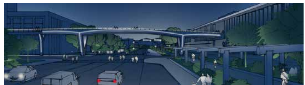
Figure 2: Bridge lighting - Option B