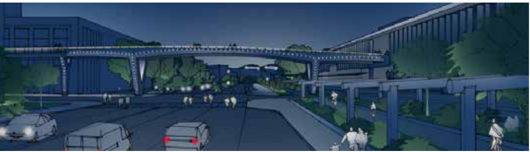
Figure 1: Bridge lighting - Option A