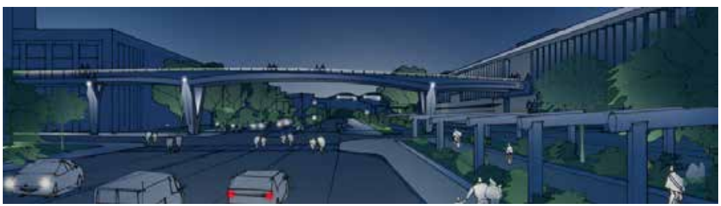
Figure 3: Bridge lighting - Option C