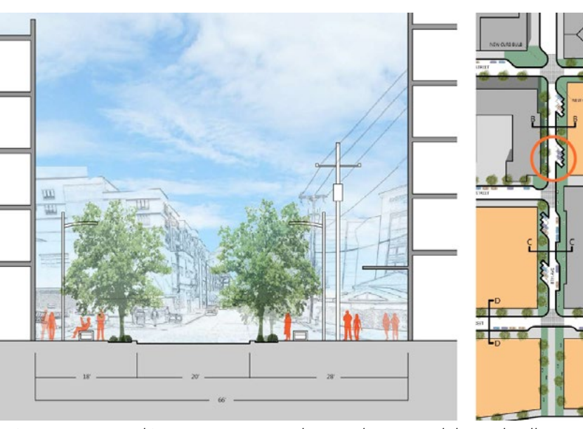
Figure 3: Proposed improvements on 8th Ave N between Aloha and Valley St.

Although dissatisfied with the decision not to provide a pedestrian crossing across Mercer Street at 8th Ave N, the SDC acknowledged the positive impact the mid-block connection along 8th Ave N will have on the pedestrian realm. The Commission recommended the Figure 5: Proposed improvements on Aloha St.