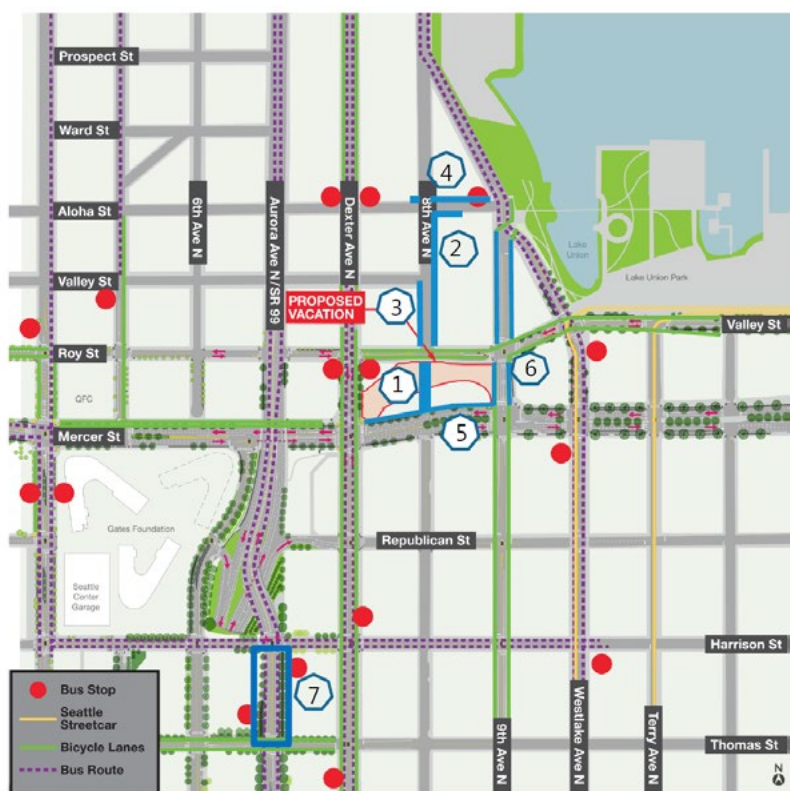
Figure 1: Proposed public benefit location