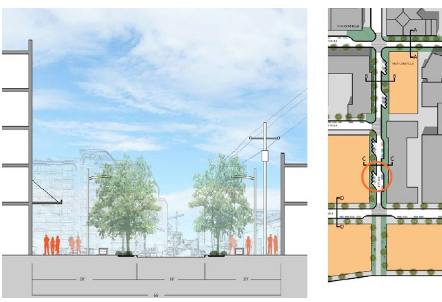
Figure 4: Proposed improvements on 8th Ave N between Valley and Roy St.