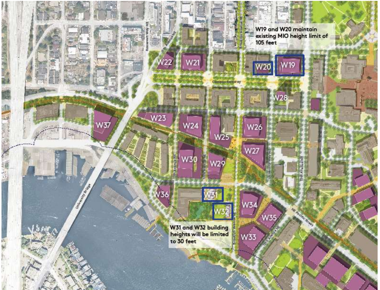
Figure 3: Recommended Conditions #21 and 22