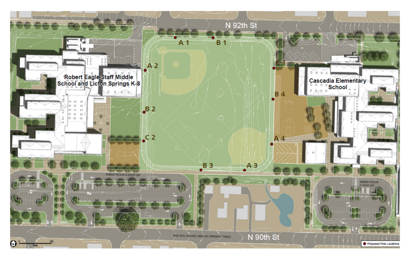
Exhibit 1 Proposed Site Plan