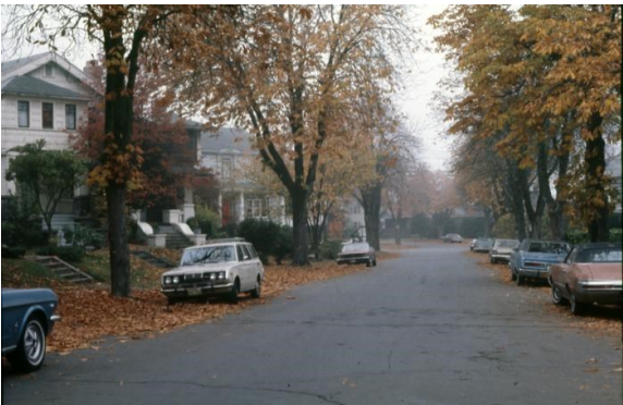
Queen Anne Boulevard, circa 1970.

County Hospital, the KOMO building, the Seattle Children's Home, and the Telephone Exchange. Iconic images of the TV towers long known to Queen Anne Hill, the Queen Anne Bowl, and Queen Anne Boulevard are also available in this wide ranging collection of Seattle's neighborhoods.