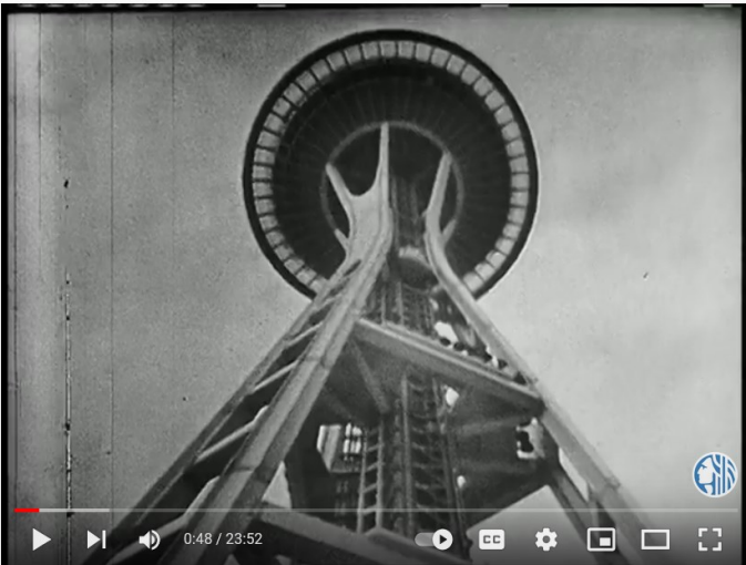
World of Tomorrow: Space Needle . Item 12803, Seattle Channel Moving Images (Series 3902-01), SMA.

One of the more popular additions to SMA's YouTube channel is a recently digitized recording of a live broadcast from the Space Needle observation tower, originally aired just prior to its official opening on April 21, 1962. At the time, the Space Needle was the tallest structure in Seattle and contained the world's highest revolving restaurant.