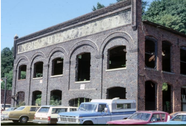
N&S Foundry, 1140 Elliott Ave West, circa 1970. Image 199441 , Series 1629-01, SMA.

Recent additions to the Historic Building Survey Photograph collection come from Queen Anne. Mid-century images of the historic neighborhood show scenes of commercial districts, schools and playgrounds, streets, parks, residences, and multi-family buildings.