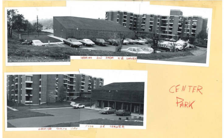
Photos illustrating parking at Center Park, 1976-1977. Box 1, Folder 11, Series 1615-01, SMA.

Zoning Code Revision Records ( Series 1615-01 ) date from 1971-1982 and relate to revisions and amendments to Seattle's zoning code. Issues include parking requirements, downtown development, definitions of particular terms in the code, and specific allowable uses such as pharmacies and printing shops.