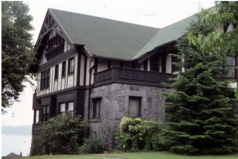
Stimson House -- 405 W. Highland Dr., circa 1970. Image 198682 , Series 1629-01, SMA.

Other buildings, including apartments such as the Chelsea, Donaphilita, Marqueen, Villa Castella, and the Aloha Terrace buildings, stand beside street scenes of daily life. Also shown are the King