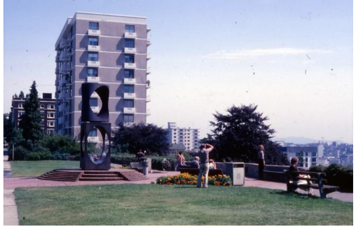
Kerry Park -- W. Highland Dr, circa 1970.