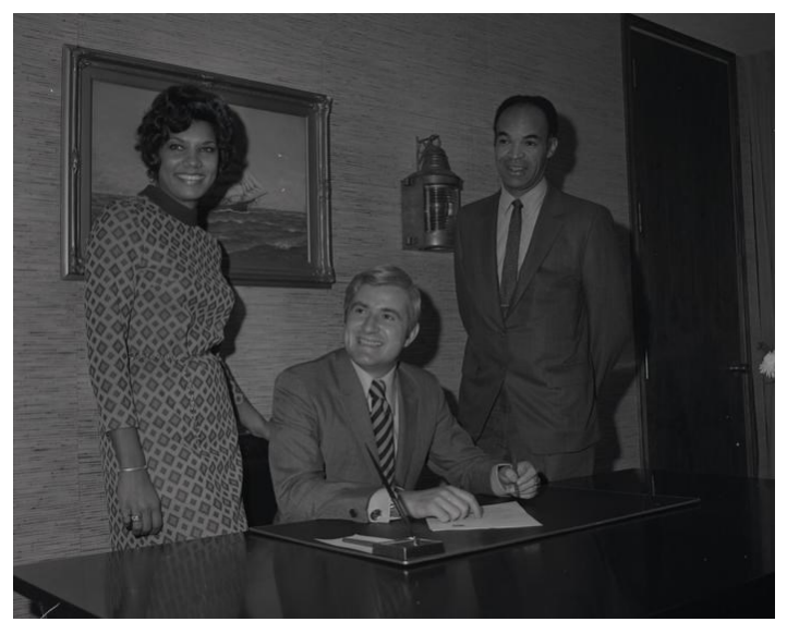
Mayor Uhlman signs Martin Luther King Jr. Day Proclamation, January 8, 1971.

The Seattle City Council City Operation Committee held a public hearing on September 7, 1984 to discuss <u>Ordinance 111890</u> (introduced as Council Bill 104430) "declaring Martin Luther King, Jr.'s birthday a City holiday and amending the Seattle Municipal Code accordingly." The bill passed unanimously and was signed into law by Mayor Charles Royer on September 17, 1984.