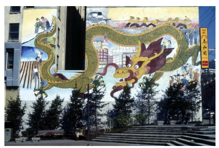
Tai Ho Mandarin Restaurant, 1970s (estimated) <u>Image 195634</u>, Series 1629-01, SMA.

Newly digitized and available online are <u>photos</u> showing buildings, businesses, parks, and street scenes in the International District. Cataloged as part of the Historic Building Survey Photograph Collection (Series 1629-01), the bulk of the photos date from the 1970s to the 1980s.