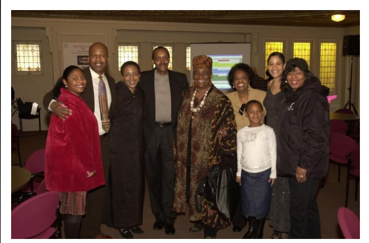
Black History Month kick-off event, February 1, 2002. <u>Item 124218</u>, Fleets and Facilities Department Image Bank Digital Photographs (Series 0207-01), SMA.

The DDL includes a narrative describing past celebrations, as well as links to city legislation, scanned archived material, and related articles in local newspapers from the 1920s to the present. Accompanying the DDL is a <u>Virtual Collection</u> pulling together photos, videos, and other records from the archives.