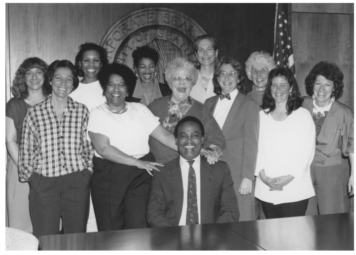
Mayor Norm Rice poses with the Office for Women's Rights in 1990. Image 186934, Series 8401-01, SMA.