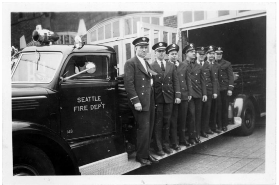
Seattle Fire Department Ladder 3 B shift, 1938 (estimated). Item 195490, Series 9995-01, SMA.

branch of the NAACP to charge the CSC with "a serious lack of understanding and sensitivity concerning the problem of Negro employment in municipal jobs... They have succeeded in perpetuating a 'white-only' Fire Department, and discouraging other Negro applicants from even trying to get employment."