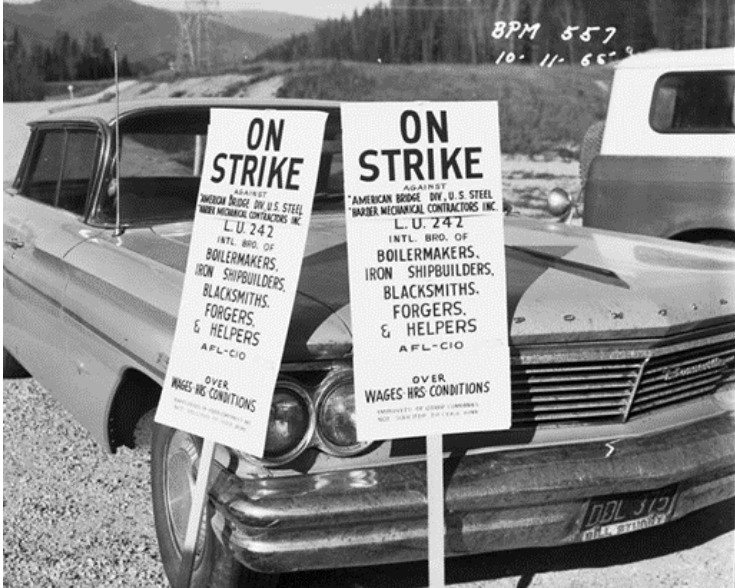
Signs used in Boilermakers strike, October 11, 1965. Item 186928 , Record Series 1204-01, SMA.

In October 1965, construction work on the Boundary Dam project was halted by the West Coast Boilermakers' Union Local 104 strike. Picketing took place in Washington, Oregon and Northern California. The strike ended after 22 days when the eight-state contract dispute was settled.