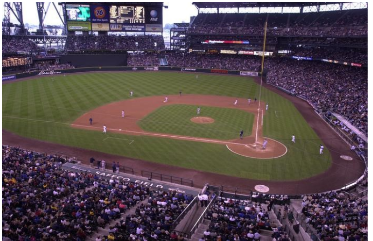
Seattle Mariners baseball game at Safeco Field on September 11, 2000. Item 105420 , Record Series 0207-01, SMA.