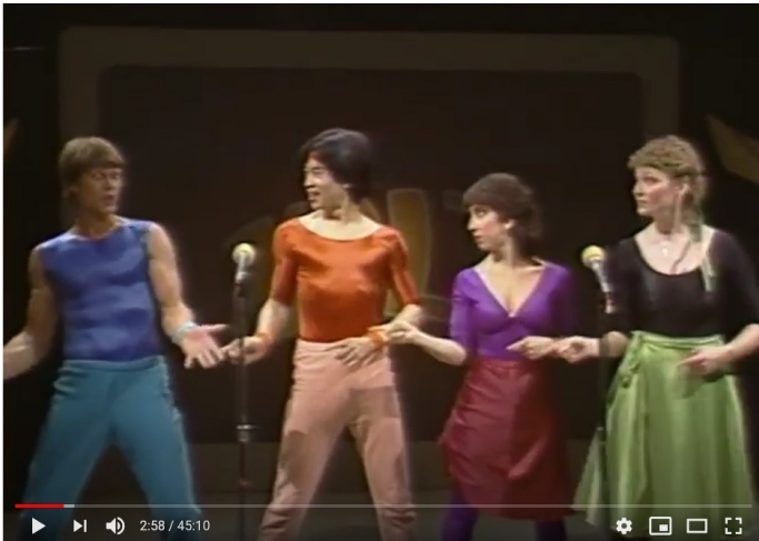
Not Too Young to Volt , November 12, 1983. Item 3346 , Record Series 1204-05, SMA.

One of the most watched videos recently added to SMA's YouTube channel is Not Too Young to Volt , containing footage of a 1983 educational musical theatrical performance on energy conservation at Ballard High School.