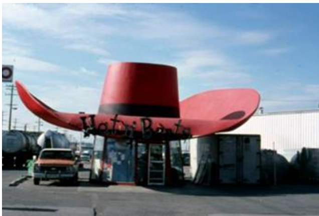
Hat and Boots Service Station, circa 1980. Item 193638 , Series 1629-01, SMA.

SMA staff created a new set of webpages featuring resources in the archives by Council District . While not an exhaustive list of what is in the archives for each district, the pages provide a sampling of records meant to engage constituents with the history of their neighborhood. The pages are structured around the themes of Parks and Recreation, Infrastructure and Public Works, Neighborhood Development and Community Services, and Legislative History.