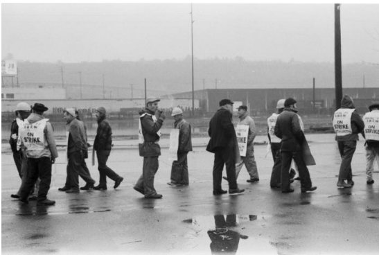
Picket lines at South Service Center, December 15, 1975. Item 192890 , Record Series 1204-01, SMA.

Other images of strike activity between 1963 to 1975 can be viewed here .