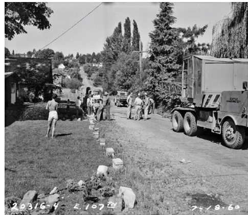
1107th St. & 30th Ave NE culvert removal, 1960. Image 65001 , Record Series 2613-07, SMA.

A clickable map gets you to pages for each of the seven districts. Each district page has a section for early records which includes topics such as the aftermath of the Great Fire, annexations, the