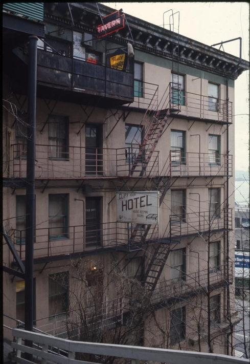
Place Pigalle Tavern, 1969. Item 195004 , Record Series 1802-01, SMA.

A popular image recently added to SMA's Flickr site is this image of the Place Pigalle Tavern, taken as part of a series showing the Pike Place Market Urban Renewal Area in 1969.