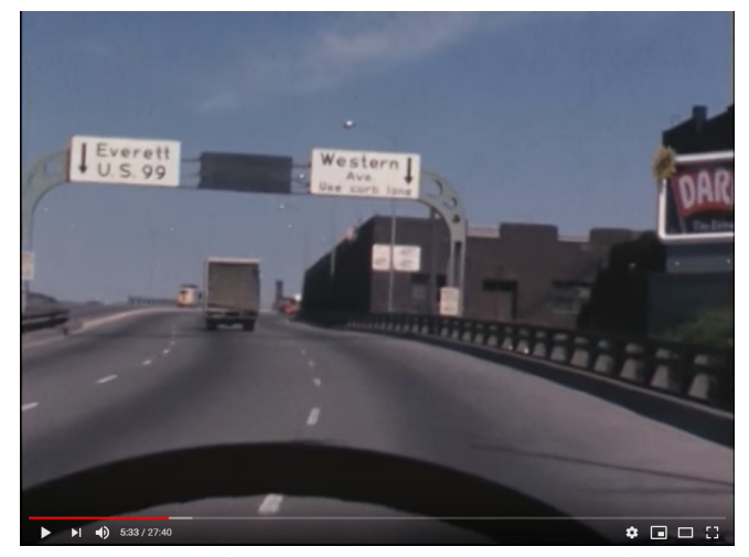
Alaskan Way Viaduct/Reconstruction of the Ballard Bridge, 1950/1940. <u>Item 524</u>, Record Series 2613-09, SMA.

Continuing the theme, one of the most watched videos on SMA's <u>YouTube</u> channel with over 36,900 views is a 1950s Engineering Department film showing the Alaskan Way Viaduct. The film also includes footage of the restoration of the Ballard Bridge, and its reopening in 1939.