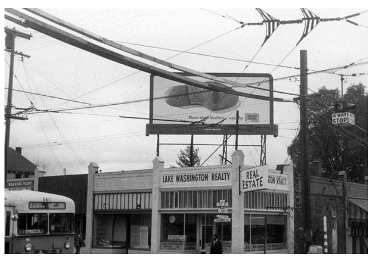
Billboard advertising the Yellow Pages at 34th and Union, 1962. <u>Item 194178</u>, Record Series 1802-0P, SMA.

As is frequently the case with photographs taken for a specific purpose, the images are useful for purposes other than the original one. Businesses, neighborhoods, and vehicles pictured in the images help inform our understanding of how Seattle neighborhoods have changed.