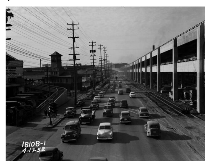
A view of Alaskan Way in 1952, at Marion looking north. <u>Item 43556</u>, Record Series 2613-07, SMA.

A popular photo recently posted to <u>SMA's</u> <u>Flickr site</u> is this photo of the Alaskan Way Viaduct, looking north from Marion Street in 1952. A Flickr user commented, "I did not realize until seeing this picture how old the Viaduct was."