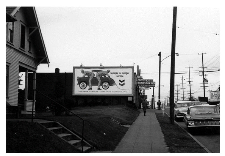
Billboard advertising Chevron near Welker's Gun Shop., 1962. Item 194185, Record Series 1802-0P, SMA.

In 1962, the Washington Roadside Council submitted hundreds of photographs of non-conforming signs and billboards to City Council as part of a petition regarding amendment of the zoning code relating to signs. The petition is not in existence, but the <a href="mailto:photos">photos</a> submitted with the petition are being scanned and cataloged as part of <a href="Record Series 1802-0P">Record Series 1802-0P</a>.