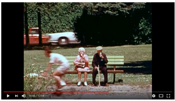
'Parks, Pleasant Occasions, and Happiness' Item 920, Record Series 5802-08, SMA

With over 1,320 views and counting, this video is bound to put you in the mood for summer. Parks, Pleasant Occasions, and Happiness was produced by the Department of Parks and Recreation in 1977 and features idyllic scenes of Seattle parks and playgrounds set to music.