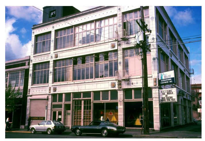
REI flagship store at 11th and Pine, circa 1980. Item 182095, Record Series 1629-01, SMA.

Popular on <u>SMA's Flickr site</u> is a recently added photo of the REI flagship store on Capitol Hill at 11th and Pine, circa 1980.