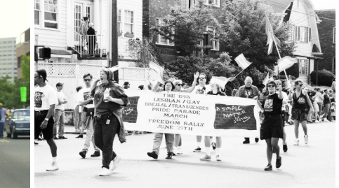
Gay Pride Parade, 1993. Item 167122, Series 8405-04, SMA.

City Council marching in the 2010 Pride Parade. Item 170656, Series 4600-11, SMA.