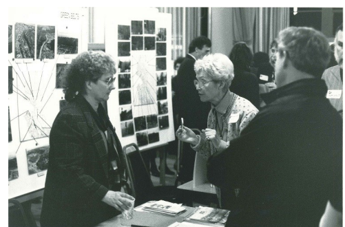
Open Space Forum, October 1991. Series 5802-07, Box 1, Folder 27, SMA.

photos, park complaints, and general parks management materials. The main focus of the records is on public relations relating to a wide variety of park related issues, most notably materials about off-leash areas for dogs.