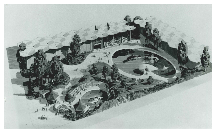
Proposed "marine park" at Seattle Center, 1966.

<u>KUOW</u> also reported on the story, adding new research and details, and using this featured image of the park as conceived by planners.