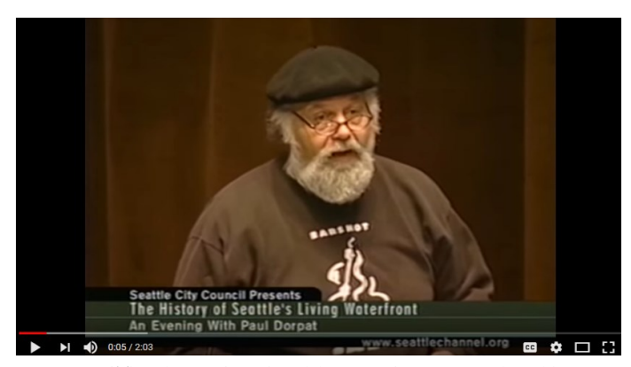
Copy of The History of Seattle's Living Waterfront: An Evening with Paul Dorpat, April 13, 2005.

One of the new uploads to <u>SMA's YouTube</u> <u>channel</u> features footage of a public presentation given by historian Paul Dorpat on the history of Seattle's Central Waterfront.