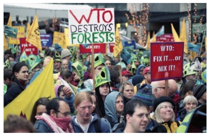
WTO Protestors on 7th Avenue, 1999 Item 176997, Record Series 0207-01.

SMA's Flickr page now has more than 3,000 images, 35 albums, and 1,800 followers. One of the newest images featured on the site is a photo from the Fleets and Facilities Department Imagebank Collection (0207-01), showing WTO protestors on 7th Avenue in 1999. You'll also find this photo posted to the Seattle Scenes album.