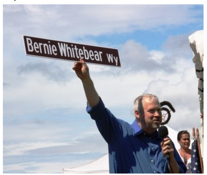
Mayor McGinn attends Bernie Whitebear Way dedication at Daybreak Star Cultural Center Discovery Park, 2011. Item 183511, Record Series 5200-03.

Images from Mayor Mike McGinn's office are now in the SMA photo database, including events such as town halls and budget hearings, signing ceremonies for the panhandling ordinance veto and rental inspection resolution, Bike-to-Work Day, South Lake Union trolley announcement, the City Hall Open House, and the dedication of Bernie Whitebear Way at Daybreak Star Cultural Center.