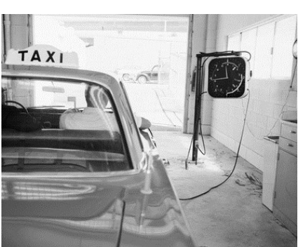
Taxi being tested for mileage calibration. Item 184111 , Record Series 2705-02.

of Public Utilities in order to enforce the keeping of proper legal weights and measures by all vendors in the City. The division included a chief inspector, two