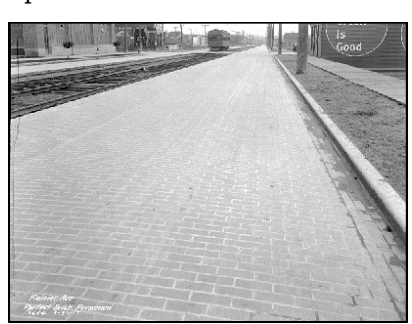
Item 1292, Record Series 2613-07.

Have you ever stopped and considered the pavement beneath your feet? A recent research question we received about the history of street and