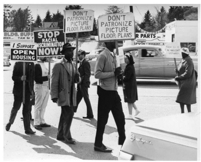
CORE-sponsored demonstration at realtor office of Picture Floor Plans, Inc., 1964. Item 63932 , Record Series 5210-01.