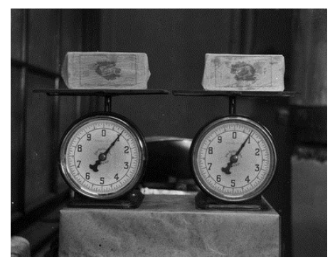
Scales find discrepancy in weight comparison, 1916. Item 184102 , Record Series 2705-02.

highlighting topics and records from SMA collections. Our inaugural exhibit features materials from the Weights and Measures unit. In 1911, Seattle City Council passed Ordinance 26477 establishing a new Weights and Measures Division in the Department