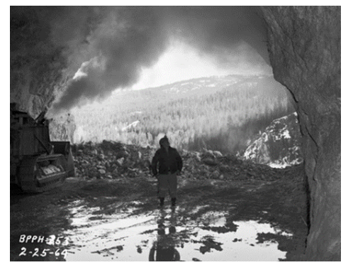
View from Transformer Bay #51 after blast overlooking river, 1964. Item 183716 , Record Series 1204-01 .

taken from 1963 through 1967 detail the technical