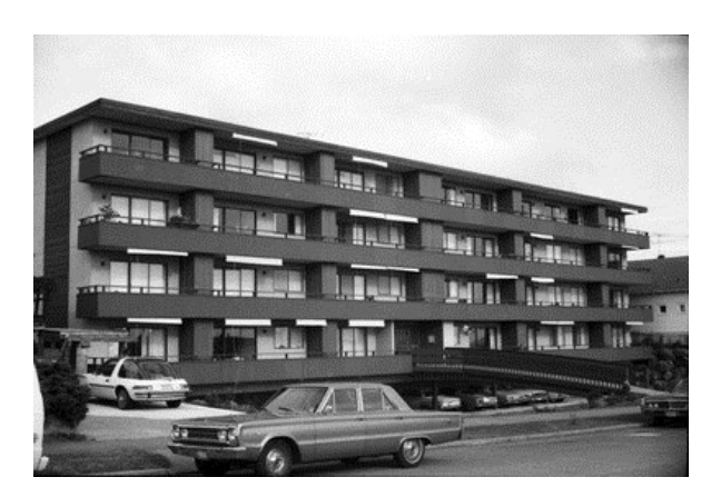
Diplomat Apartment Building, 4444 44th Ave SW, June 1976. Item 179099, Record Series 9701-01, SMA

Photographs from a 1975 neighborhood survey are being added to the photograph database. West Seattle is the first neighborhood to be showcased and although not all images are scanned yet, a good sample is available. Undertaken as part of the country's bicentennial, the project was administered by the Historic Seattle Preservation and Development Authority with funds from the National Endowment for the Humanities and the City of Seattle. The goal of the project was to create a visual inventory of urban design, historical and architectural elements that gave Seattle its unique character and identity. All of the images in this record group are black and white.