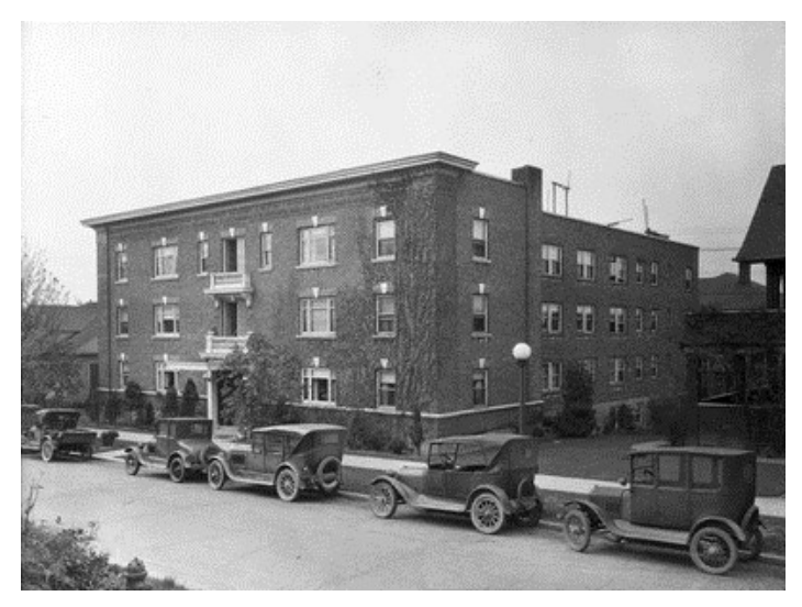
University District apartments, April 17, 1928 Item 2906, Seattle Municipal Archives

One of the most popular images on <u>SMA's</u> <u>Flickr site</u> from 1928 showing a line of 1920s vehicles in front of a University District apartment building.