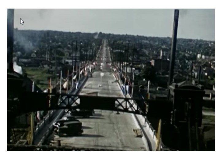
Construction and opening of the Ballard Bridge, 1940 Item 524, Record Series 2613-09, Seattle Municipal Archives

The Ballard Bridge continues to be the most popular video on SMA's YouTube site.