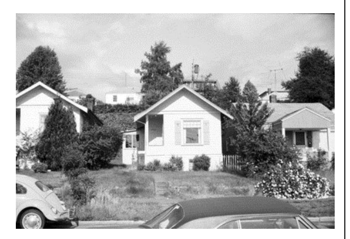
4508 46th Ave SW, June 12976 Item 179100, Record Series 9701-01, SMA

Work is proceeding scanning images in a related record series, 1629-01, with funds from a 4Culture grant. This collection includes color images of homes and businesses throughout the city between 1976 and 1979.