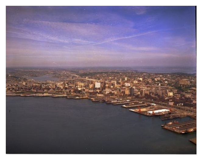
Aerial of waterfront and downtown, 1968 Item 78786

The most popular image on SMA's Flickr site in the past three months is a 1968 aerial view of downtown and the waterfront.