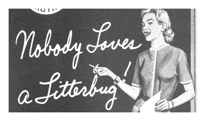
Education materials by "Keep America Beautiful." Box 38, Folder 11, Office of the Mayor Subject Files, Record Series 5210-01.

Buoyed by the "Keep America Beautiful" campaign by the National Public Service Organization for the Prevention of Litter, the Mayor corresponded with Detroit, New York and other cities regarding how they enforced their anti-litter laws and how they raised money to beautify their cities. "Keep America Beautiful" also created teachers' guides for both elementary schools ("Nobody Loves a Litterbug!") and high school ("It's Everybody's Job!").