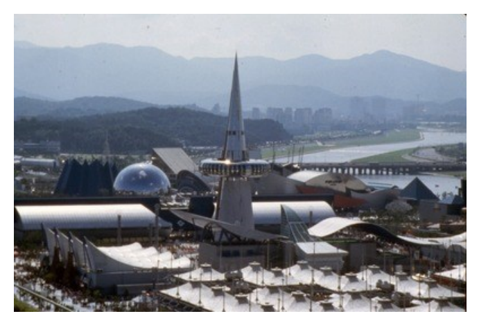
Taejon, Korea, 1989. Item 176970

In 1994, the Office of International Affairs held a public program called "A World of Magic" allowing Seattle's citizens to explore more than twenty Sister City relationships. Slides from the program were recently cataloged and digitized to allow access via the Photo Archives online catalog. From Europe to Asia, New Zealand to South America, Indonesia to Uzbekistan, 88 images from 18 Sister Cities highlight the cultural exchange embodied by this program in such elements as agriculture, houses of worship, athletic arenas, parades, education, transportation, civic institutions, street scenes, and more.