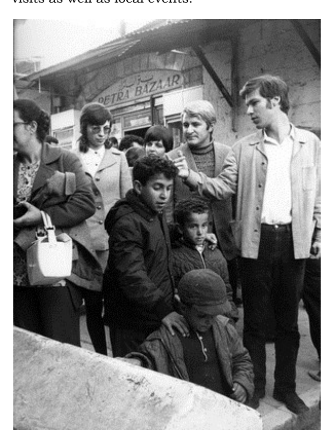
Mayor Wes Uhlman tours Jerusalem, 1971. Item <u>176849</u>

Images from Mayor Uhlman's records, 5287-04, were also scanned and include some international visits as well as local events.