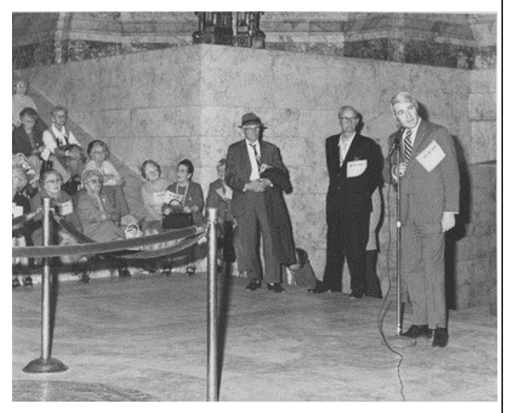
Mayor Wes Uhlman testifying in Olympia on "Save our Buses,"

<u>Item 176814,</u> Seattle Municipal Archives