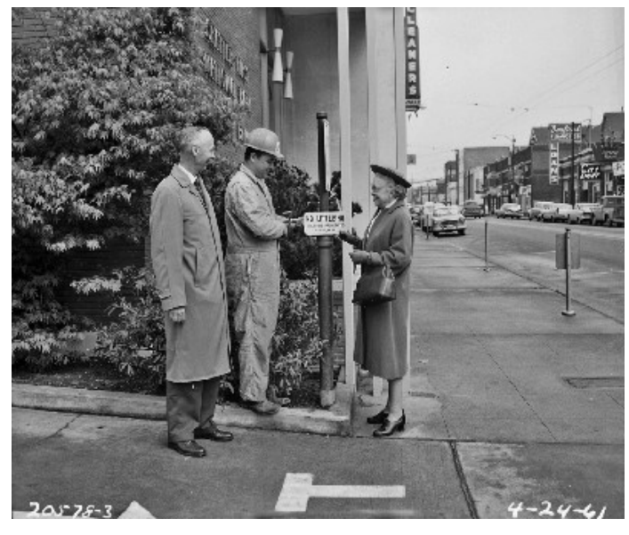
Installation of "No Litter" sign at University Way and NE 47th, April 24, 1961.

Signs were posted to enforce the litter law. By the end of 1961 over 500 litter receptacles had been installed, heavily concentrated in the downtown area.