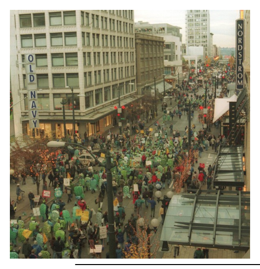
WTO Protest March on Pine Street, November 29, 1999

A US history textbook publisher, Flat World Knowledge, Inc., is using three images of WTO in a forthcoming publication.