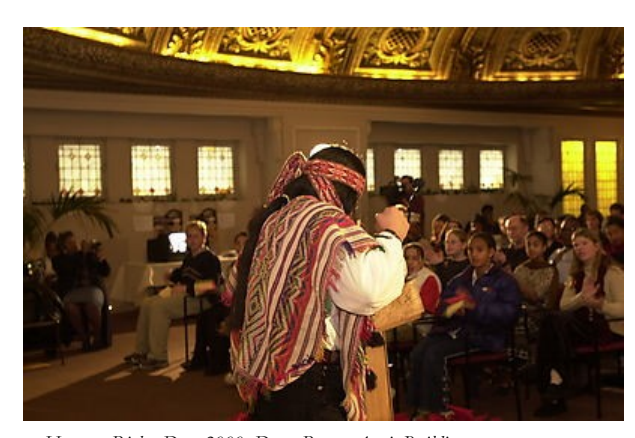
Human Rights Day, 2000, Dome Room, Arctic Building Items 108891 (above) and 108971 (below), Seattle Municipal Archives

The City's Celebration of Human Rights Day, December 10, is documented through photographs. Human Rights Day honors the United Nations' adoption of the Universal Declaration of Human Rights.