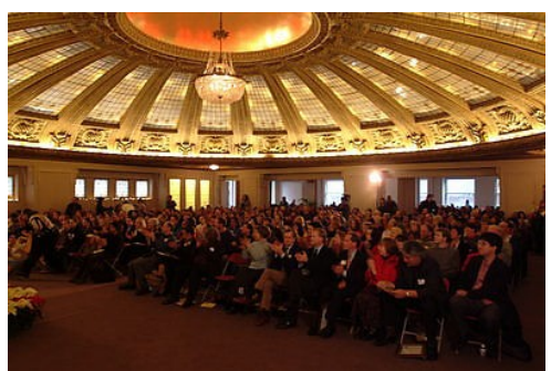
Over 400 new images were added to the