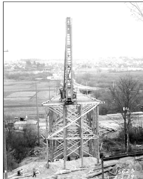
Construction of NE 45th St viaduct, April 1939.

The NE 45th Street Viaduct construction began in 1938 to improve east-west routes in north Seattle. A variety of different funds were used over the years to build and maintain the viaduct. To coincide with the recent viaduct renovation, the Archives created a collection of digital documents to tell the viaduct's story from the 1930s to the present. Visit the Digital Document Library and take a look!