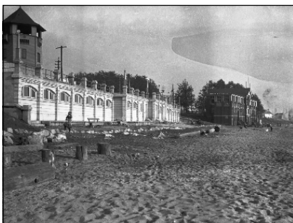
English Bay Bathhouse, Vancouver, 1910. Item 52042, Seattle Municipal Archives

street as Broadway on Capitol Hill. In another case, an image was labeled on the sleeve simply as “Beach, 1910.” We asked for help in determining the location both on our Flickr page and on the Vintage