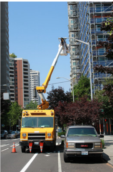
City Light lineworkers begin pilot program of arterial LED streetlights along 2nd Ave near Wall St. August 2, 2010 Item 164512

based image file submission form. Using the City's internal internet, employees can use the web form to upload several hundred photos at a time. Also, employees are able to apply item level description, dates, photographer information, and simple subject indexing so that when the photos reach the Archives they are already minimally processed and can be uploaded to the Photograph Index online.