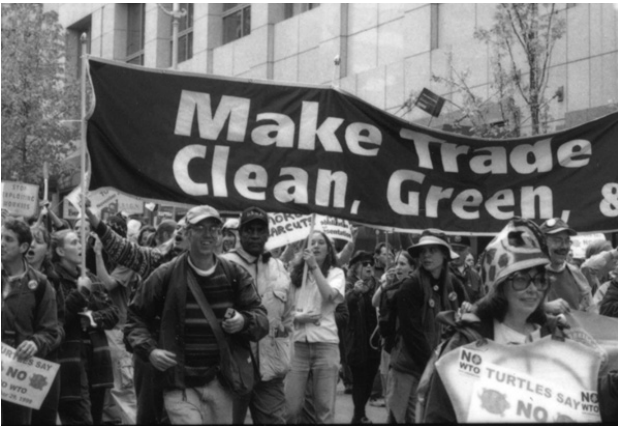
WTO Demonstration, December 29, 1999.