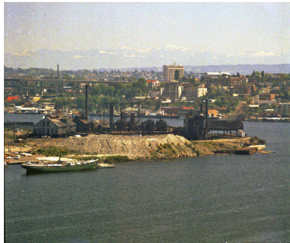
Gas Works Park before it was a park, May 1971. Item 77122, Seattle Municipal Archives

http://www.flickr.com/photos/seattlemunicipalarchives/4840938901/