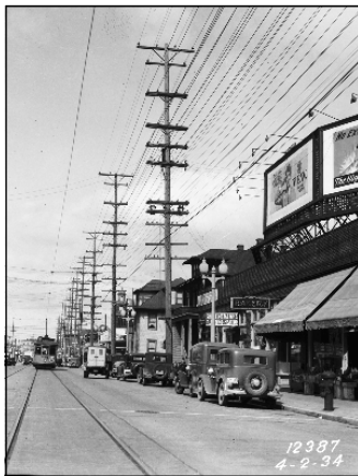
Broadway looking north from about Thomas, March 24, 1934 Item 8760, Seattle Municipal Archives

The interactive nature of our Flickr page has the advantage of allowing us to collect new and corrected information about our images. Commenters often point out interesting details in our photos and give more information