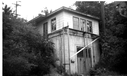
Photograph submitted with letter from Vern Millman regarding building permit at 1857 Ravenna Blvd. Accompanying CF 225076. Item 75134.

Vern Millman wrote on August 5, 1954, "We question the justification for permitting living quarters to be built over an unsightly structure.... Also...we feel that at least the work should be