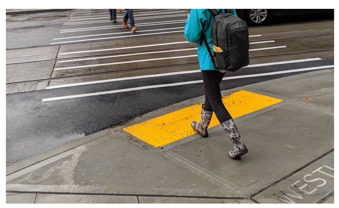
New and upgraded curb ramps at many intersections along N 50th St.

For cost savings and efficiency, the rapid flashing beacons at N 50th St at Dayton Ave N and Woodland Park Ave N will be constructed and installed at a later day by SDOT crews. It is currently anticipated that they will be installed in 2022.