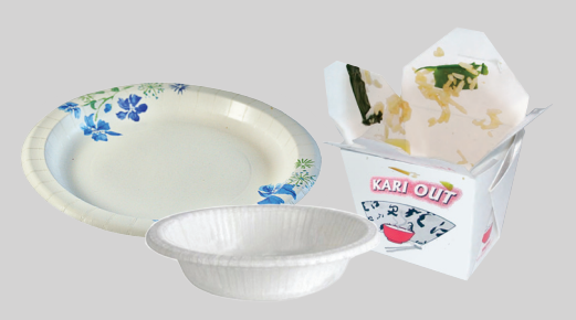
Food-soiled coated (shiny)