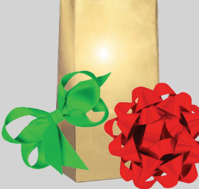
Ribbons, bows, and metalic gift wrap