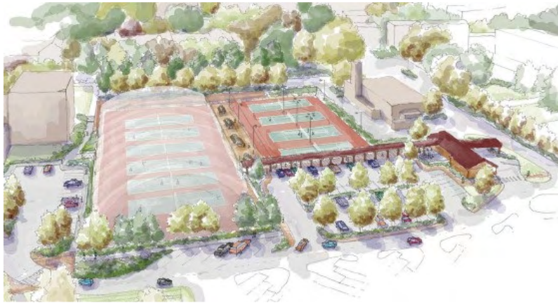
Proposed View to West