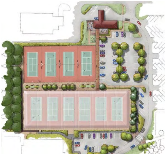
Proposed Site Layout