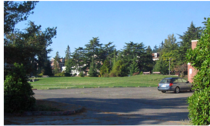
Site View to Southwest