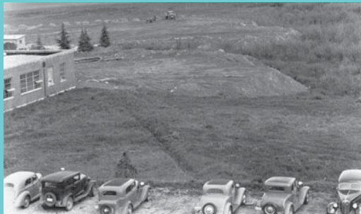
At the time this photo was taken, wetlands, then referred to as swamps, were considered as having little value. This photo shows the wetlands being filled to serve the naval station. (Also, note the hill in the distance, Sand Point Head, being leveled.) We now recognize that wetlands, such as those in front of you today, have great value ecologically.