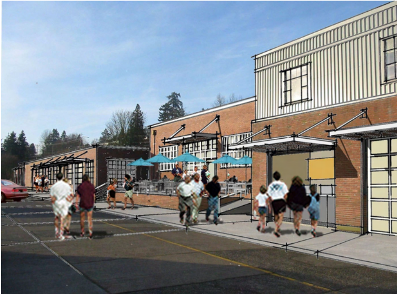
East Side Exterior