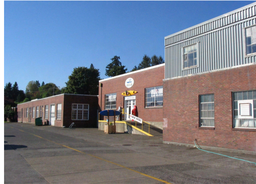
East Side Exterior