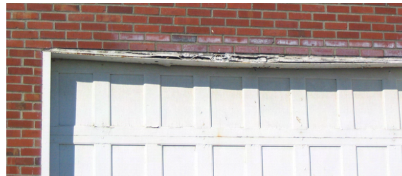
Weather Worn Door Frame