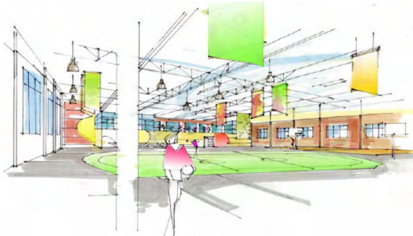
Interior Main Floor