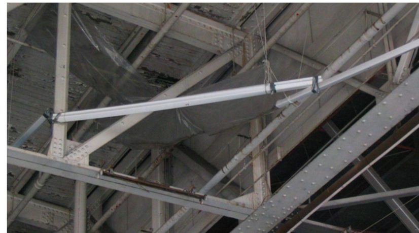
Interior Roof Leak Collection System