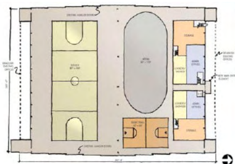
Main Hangar Floor Plan