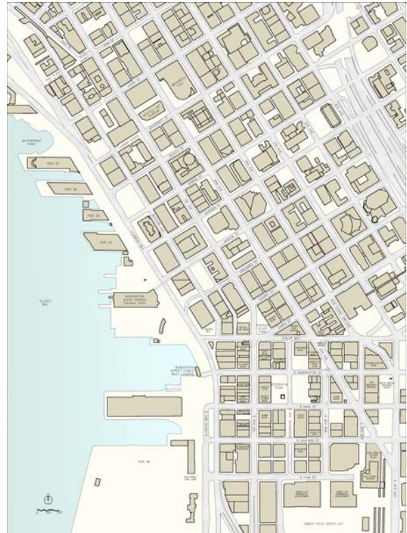
Project Base Map