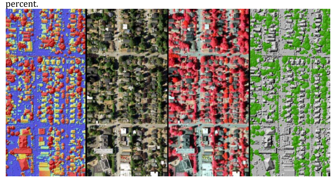
Three different ways to measure tree canopy from left to right: LiDAR, aerial photography, and color infrared, with Seattle's final LiDAR-based tree canopy result mapped on the far right.

To help fill that void, researchers at MIT recently developed a new metric derived from Google street view images called the Green View Index (GVI) that quantifies how much tree cover a person at street level experiences. Of 27 international cities Seattle's GVI came in at 20 percent, ranking in the middle of the pack. For comparison, Vancouver, BC, was 26 percent; Sacramento was 24 percent, Boston was 18 percent; Los Angeles was 15 percent; and Paris was 9