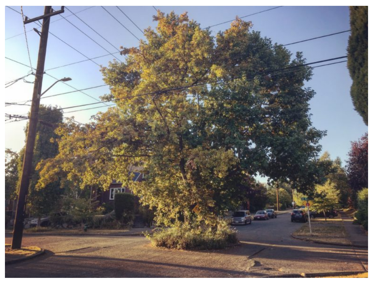
Over the past 30 years Seattle has installed over 1,000 traffic circles that take back part of the right-of-way in intersections in residential neighborhoods to create space for trees and other greenery, and calm car traffic at the same time.