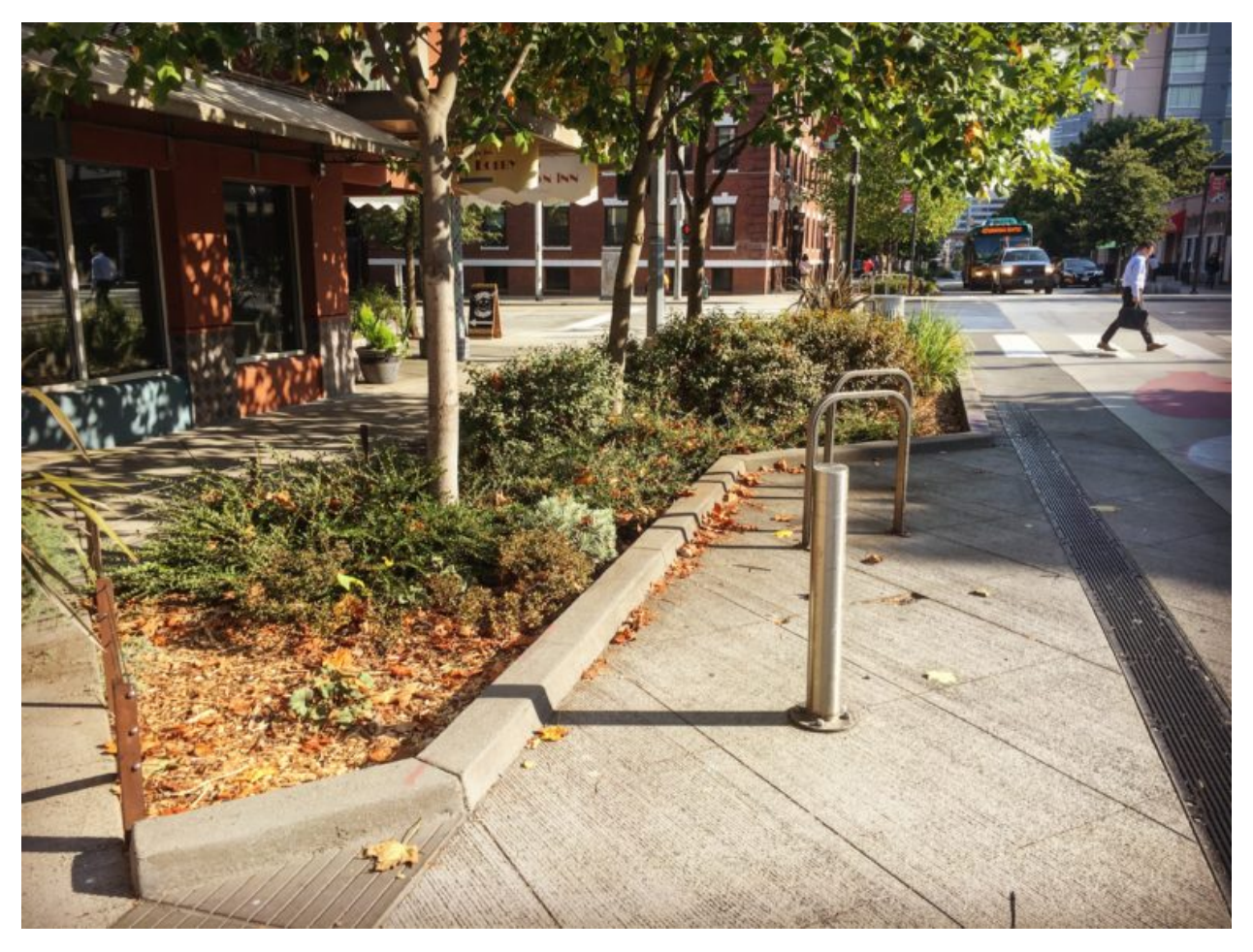
On Seattle's Bell Street Park, the city narrowed the portion of the street devoted to car lanes and repurposed the right of way for trees, bike parking, and expanded sidewalks.