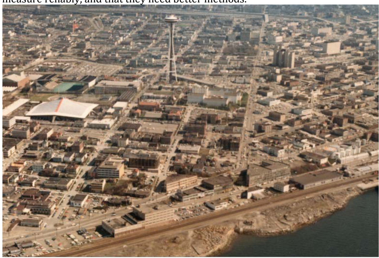
May 1970 aerial photo of Seattle's Uptown neighborhood at the north edge of downtown illustrating lack of tree canopy coverage. Click photo to enlarge.

Portland's data indicates canopy rose from 27 percent in 2000 to hit that 31 percent in 2015. In contrast, Vancouver's LIDAR data showed a decline of 23 to 18 percent from 1995 to 2013—that's a full one fifth loss of canopy. Based on aerial photos, Seattle measured a smaller decline of 33 to 31 percent from 2007 to 2015, and an earlier study found much lower coverage but with a slight increase over time from 22.5 percent in 2002 to 22.9 percent in 2007. That these three Cascadian cities—with similar age, climate, environmental ethic, and zoning that reserves about half of their land for detached houses—would report such divergent canopy trends underscores that it's actually a hard thing to measure reliably, and that they need better methods.