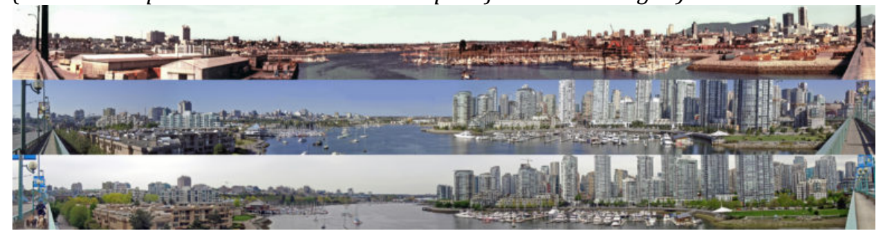
Downtown Vancouver, BC, as seen from the Cambie bridge in 1978, 2003, and 2017, illustrating how cities can densify and add trees at the same time. (CLICK TO VIEW A TIME LAPSE OF THE THREE IMAGES).

(Click on the photo below to see a time lapse of the three images.)