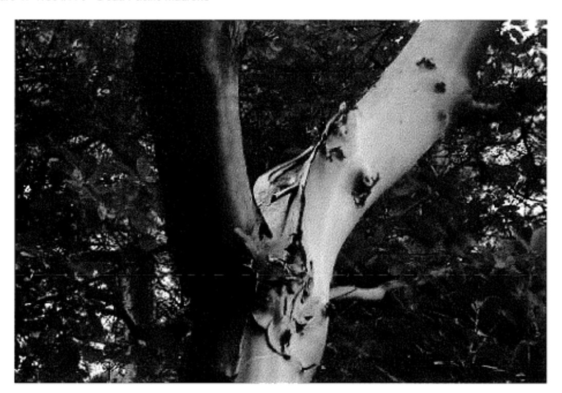
Figure 2. Tree #776 - Damaged Pacific Madrone