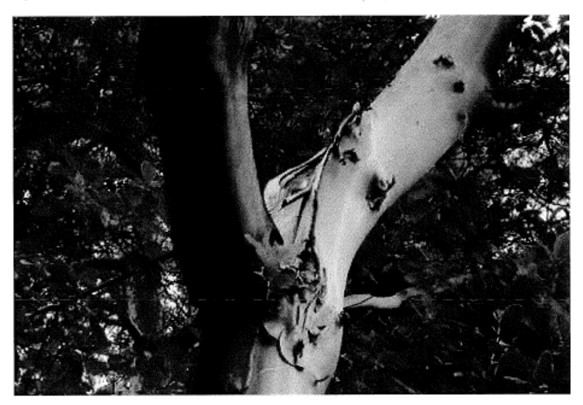
Figure 2. Tree #776 - Damaged Pacific Madrone