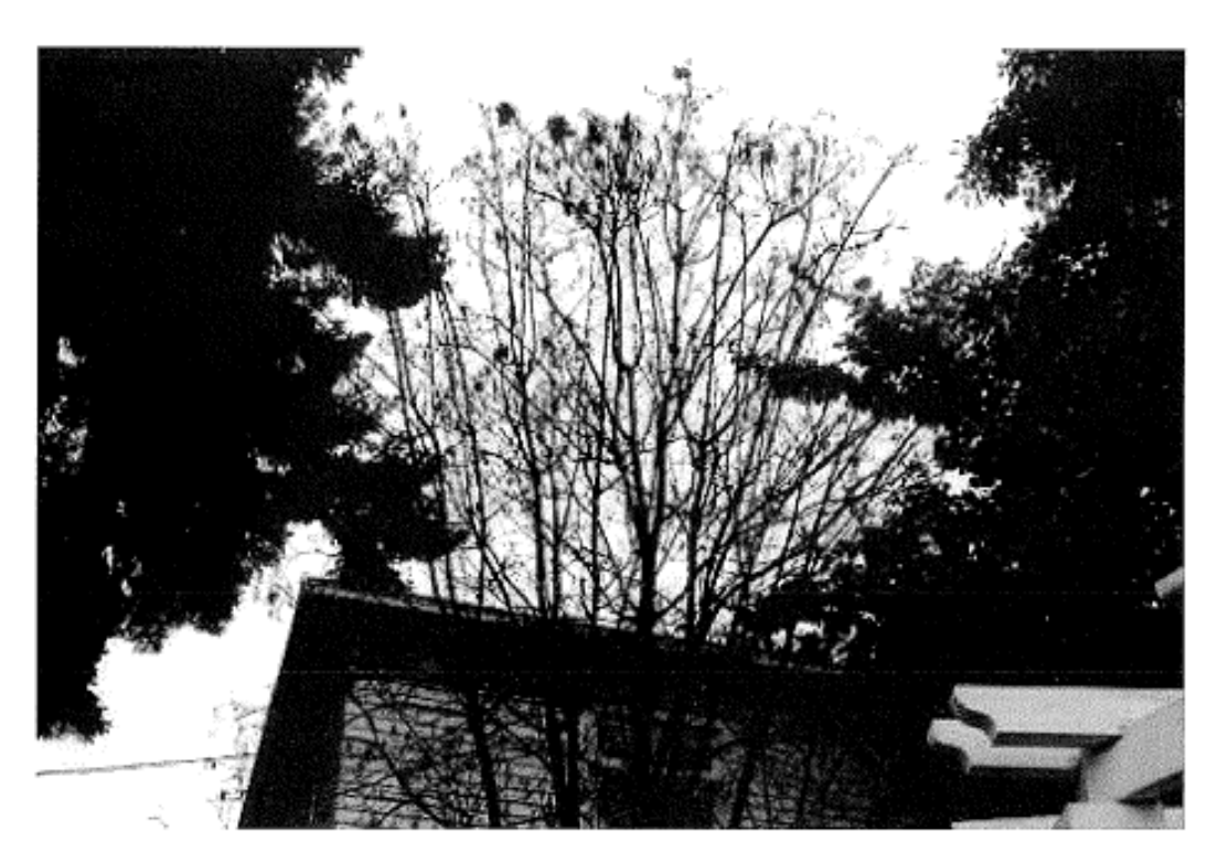
Figure 1. Tree #770 - Dead Pacific Madrone