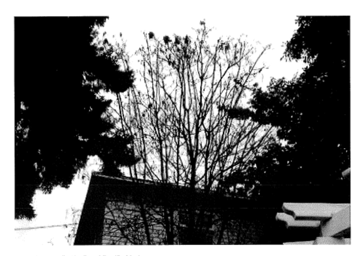
Figure 1. Tree #770 - Dead Pacific Madrone