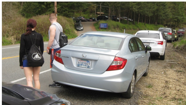
Jim Whittaker Wilderness Peak Trailhead,