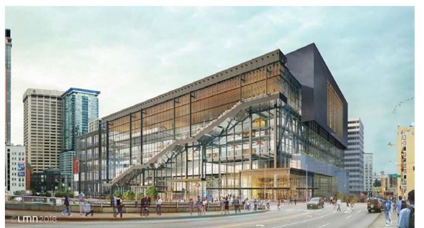
WA State Convention Center