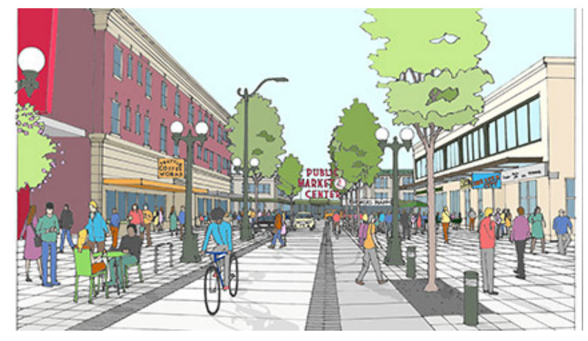
Pike Pine Renaissance