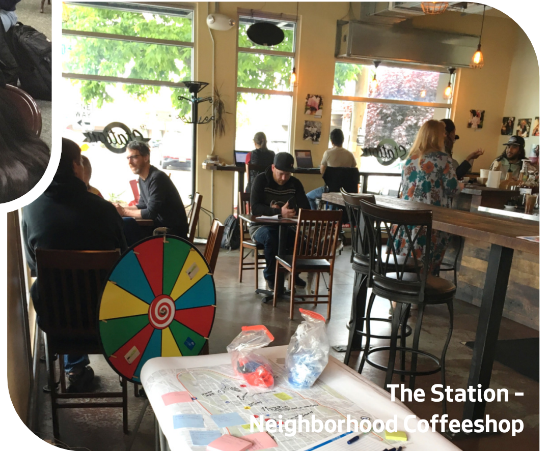
The Station - Neighborhood Coffeshop