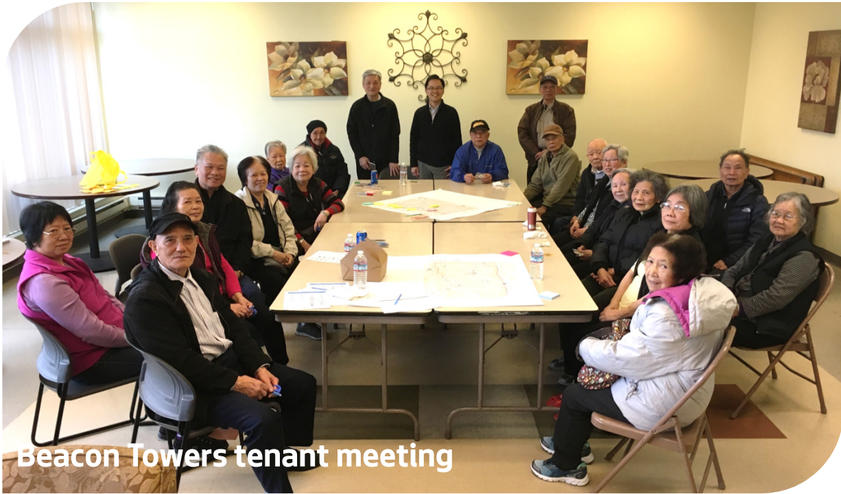
Beacon Towers tenant meeting