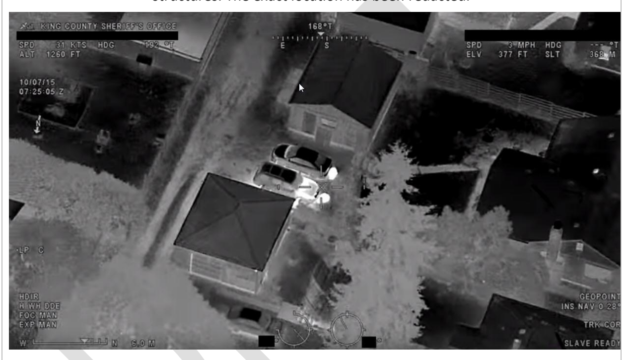
Example 2: A closer view of a residential structure illustrating Guardian One FLIR camera system capabilities.