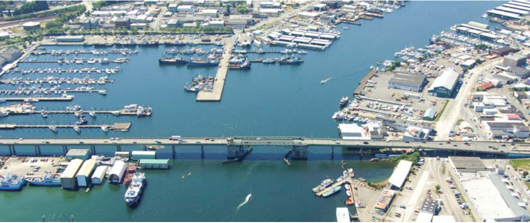
Top: Magnolia Bridge, Bottom: Ballard Bridge