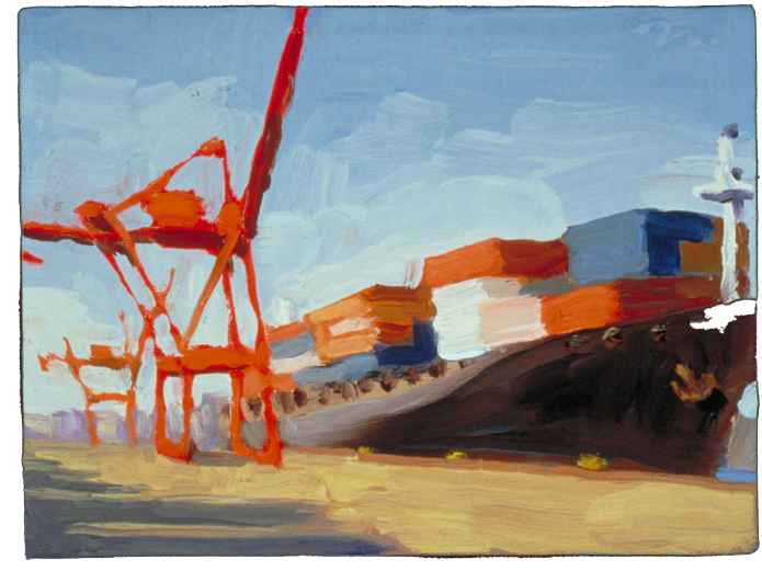
Little Ship (T18) Mary Iverson Oil on Canvas, 6" x 8" x 1" Seattle City Light 1% for Art Portable Works Collection