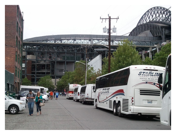
Buses queuing on Occidental Avenue South west of Safeco Field Garage after a recent Mariner's game.

In addition, the location on Occidental Avenue South defined for a pedestrian mall is currently used for charter bus queuing for other events and games. It is unclear where this would occur if this area was no longer available.