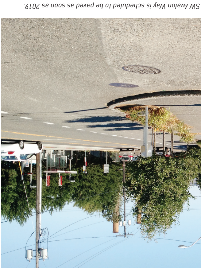
SW Avalon Way is scheduled to be paved as soon as 2019.

Si necesita traducir esta información al español, llame al (206) 684-8105.