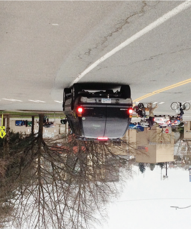
E Green Lake Way N is one of several streets in the neighborhood scheduled to be paved as soon as 2019.