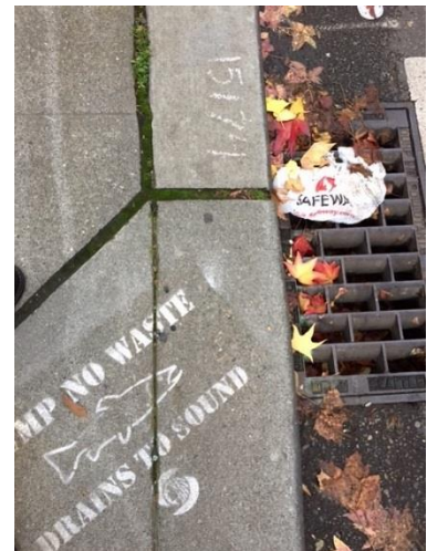
Carry-out Bag on Seattle Storm Drain

We can assume that when fewer plastic carryout bags are provided to customers, fewer also become litter, just as fewer end up in the garbage. Benefits are many, including less marine debris, fewer bags clogging storm drains, and fewer bags to clean up through hand-picking and street cleaning. However, we are currently unable to quantify the specific benefits.