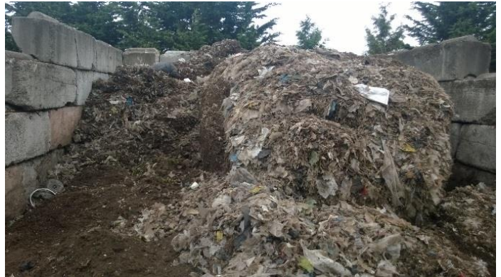
Plastic Contamination at a Compost Facility

SPU has participated with the Washington Organics Contamination Reduction Workgroup (WOCRW) to examine compost contamination issues and seek solutions. WOCRW, through surveys, confirmed that plastic bags are considered the most prevalent contaminant by compost facilities and recycling educators throughout the region. Some people are mistaking green tinted plastic bags as being compostable and are putting food scraps in these bags into their organics cart. Eliminating green tinted plastic produce and other bags in Seattle will help this situation. There is also a problem with clear tinted bags contaminating compost, which will continue to be addressed through public outreach and education. Compost facility representatives have expressed support for plastic bag bans as potentially limiting the number of bags that can be mistakenly put into the compost cart. They have also acknowledged that plastic film will continue to be a problem and that it is possible to remove larger pieces of plastic film with special equipment, though it is costly to do so. Some contaminants, such as glass and small hard plastics are much more difficult to remove. SPU has no means to determine the impact of Seattle bag regulations at compost sites as other programs without similar regulations also deliver to those facilities, and the compost facilities do not conduct detailed incoming composition studies due to costs.