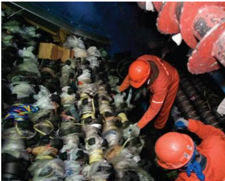
Plastic Wrapped Around Sorting Screens at Materials Recovery Facility

SPU participated in the Department of Ecology stakeholder group that developed a report titled Optimizing the Commingled Recycling Systems in Northwest Washington . The report finds that plastic bags, when included in single stream recycling programs, create significant problems and costs at the material recovery facilities receiving and sorting materials. They clog screens designed to separate containers from paper. To unclog screens, equipment must be shut down several times a day and employees must hand cut the plastic bags from the equipment, which is a difficult and dangerous job. Plastic bags also contaminate other commodity streams, especially paper. Bags that are successfully sorted for recycling are typically too dirty and contaminated for domestic markets and are typically exported to Asia.