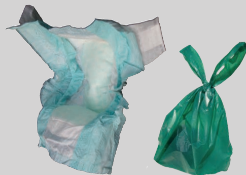
Xafaayadaha & wasakhda xayawaanka (bacayn)