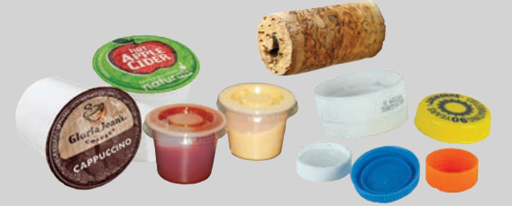
Daboolada yar yar, furarka, xagga sare, & koobka (ka yar 3 inji baladhka)