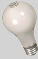
Nalalka aan ahayn laambadaha