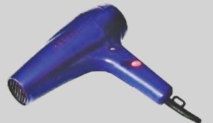
Qalabka yar yar ee guriga