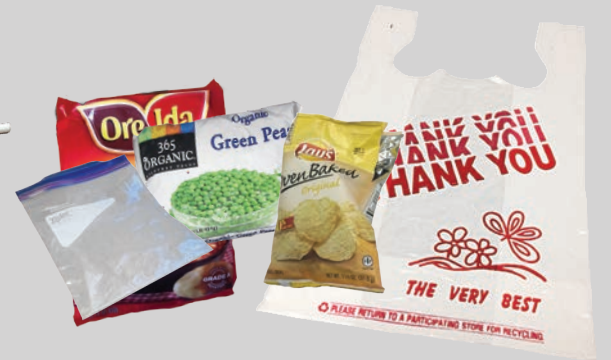
Ziploc®, cuntada & bacaha caaga ah oo hal ah