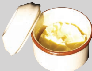
Duxda kijada, saliido & subag (oo ku jira weel ilaashan)