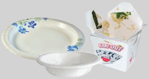
Cuntada xumaatay waraaqaha ku daboolan (dhalalaya) saxanada, madiibadaha iyo weelalka waxa lagu qaato