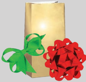
Maro yar oo wax lagu xiro, maro wax lagu qurxiyo, iyo bir lagu duubo hadiyadda