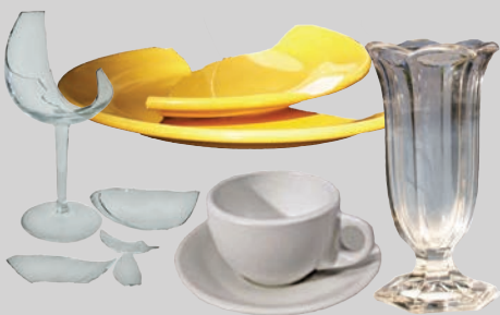
Weelka dhoobada ka samaysan & weelka quraaradda ah (jabay ayaa aan la isticmaali karin)