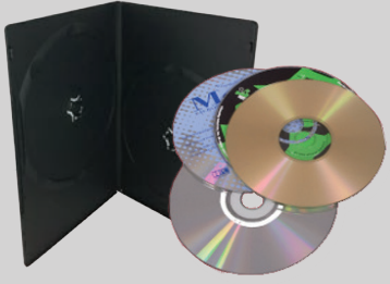
CD-yada, DVDyada, iyo kiisaska

Ku rid ashayaadaan gaadhi gacankaaga guddaafadda.