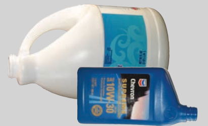
Weelasha ashyaada sunta faaruqa ah