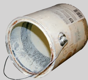
Qasaacadaha rinjiga (daboolka ka fur, qalaji & faaruqi)