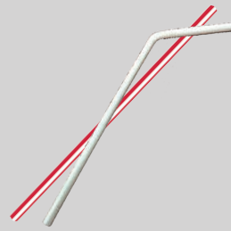
Dhuunta yar ee wax lagu cabo