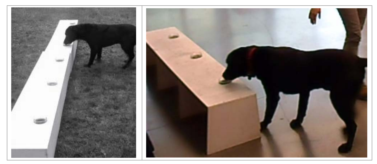
Figure 2-1. Sampson demonstrating the bench training method