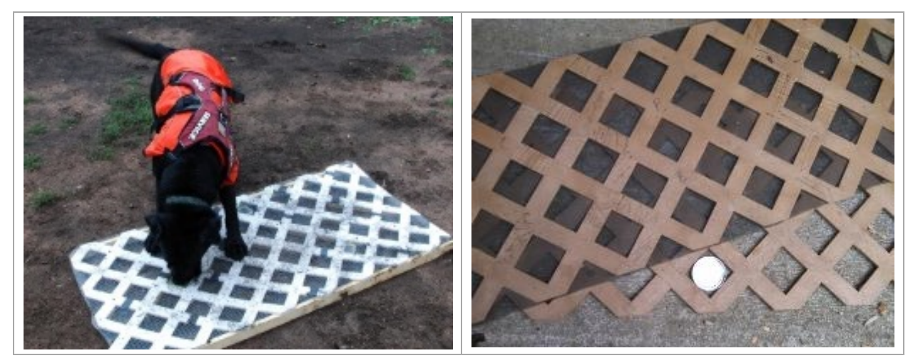
Figure 2-2. Sampson demonstrating the screen training method (left) and the layers of the screen training apparatus (right)