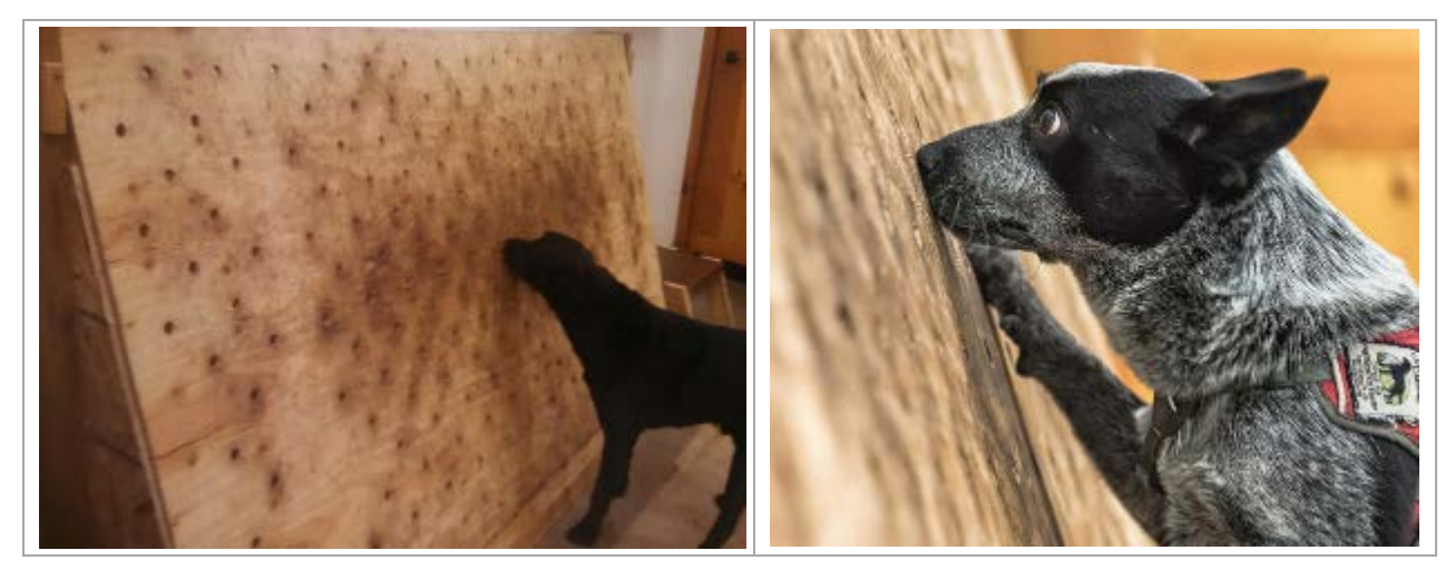
Figure 2-3. Sampson (left) and Pips (right) demonstrating the wall training method

The wall training technique was used to further develop Sampson's scent detection skills by increasing the level of difficulty in PCB detection (Figure 2-3). The wall provided a vertical plane that contained holes leading to either 1) an open environment, 2) jars with control material, or 3) a jar containing the target chemical. A large wall (220 holes) and a portable wall (15 holes) were used between September 2016 and January 2017. All training samples (including Aroclor 1254, Aroclor 1260, and SPU archived samples) were utilized separately in this training method (i.e., only one type of training sample was used at a given time).