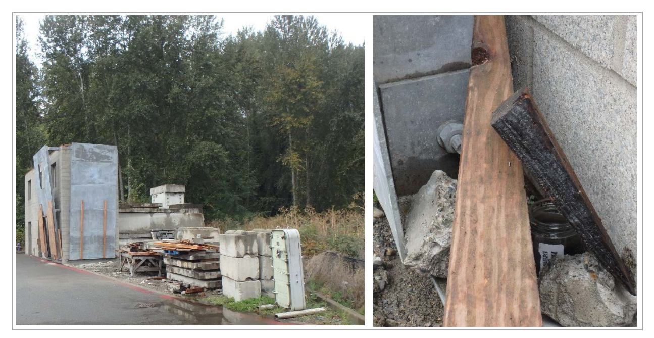
Figure 3-2. Hidden PCB test area (left) and close-up of hidden sample (right)