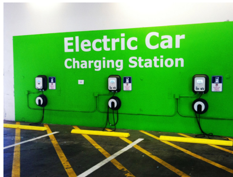
SPU will have charging stations at the new SOC for electric fleet vehicles.