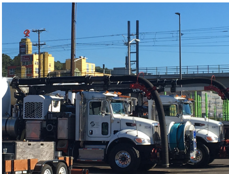
Crews will use rainwater to supply the water needed for vactor trucks at the new SOC.