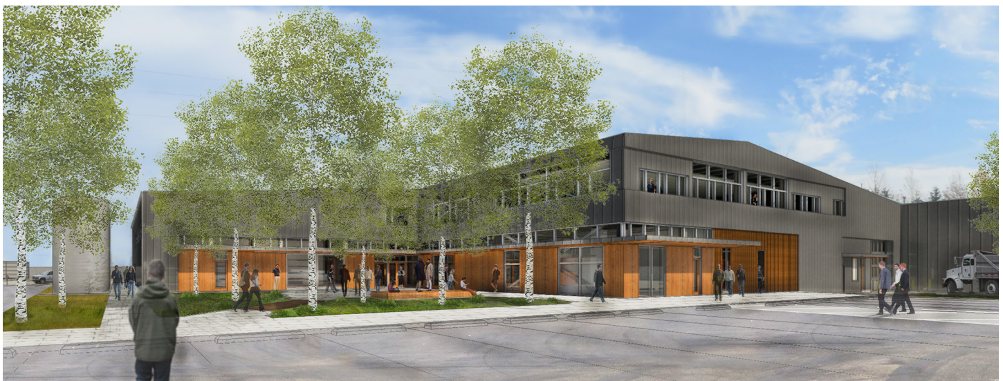
Rendering of new SPU South Operations Center