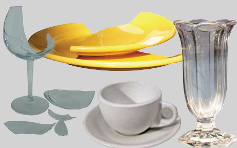
Ceramics & glassware (broken or unusable)