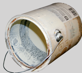
Paint cans (lid off, dry & empty)