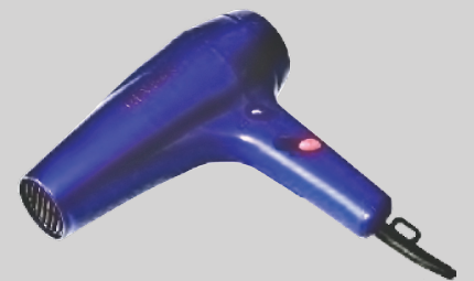
Small household appliances