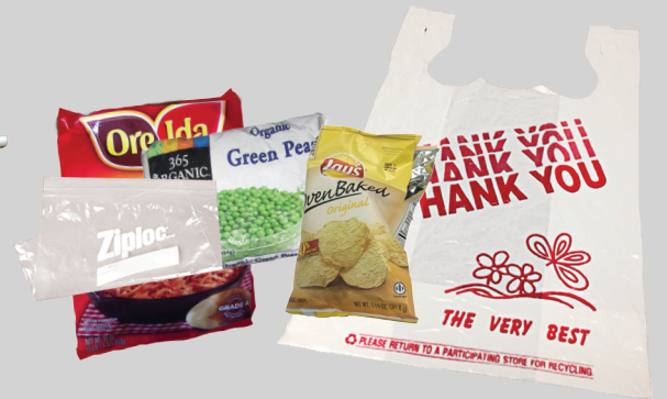
Ziploc®, food & single plastic bags