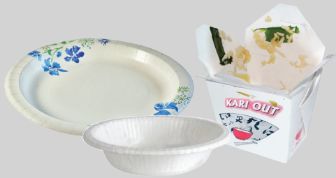
Food-soiled coated (shiny) paper plates, bowls and take-out containers