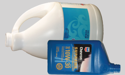
Empty toxic materials containers