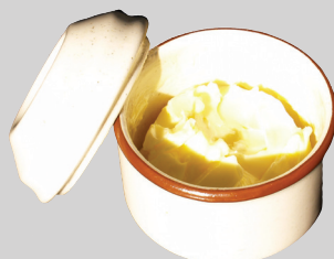
Kitchen fats, oils & grease (in a secure container)