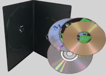
CDs, DVDs, and cases