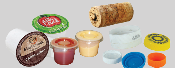
Small lids, caps, tops, & cup (less than 3 inches wide)