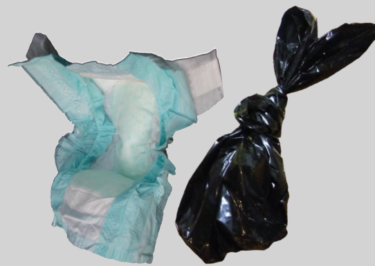
Diapers & pet waste (bagged)