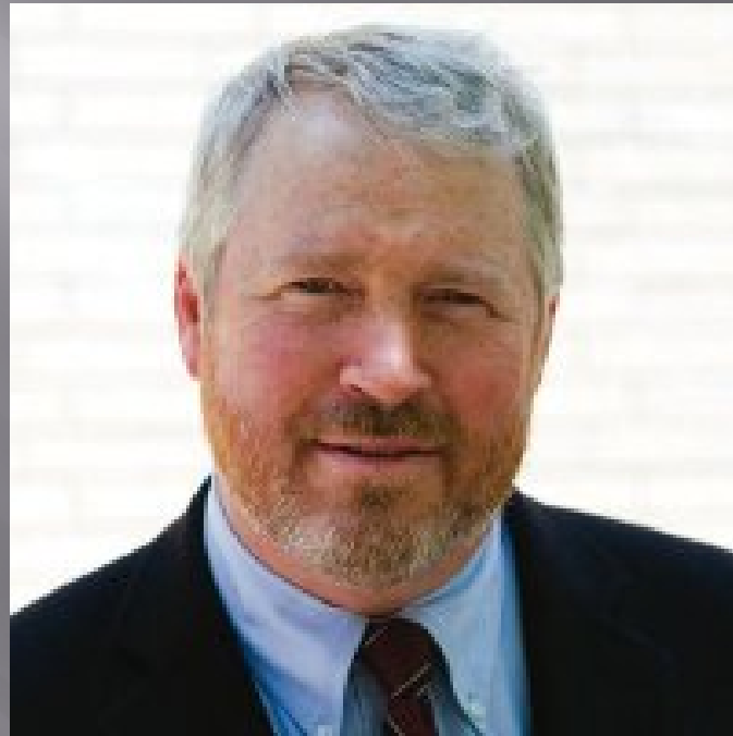
Mayor Mike McGinn City of Seattle