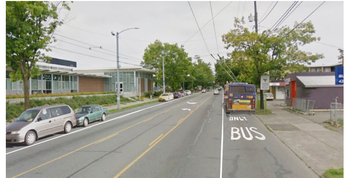
Ka dib dhismaha (dayrta 2018)

galay fulinta laga bilaabo Waddada S Kenny St illaa S Henderson St. Bedelkaan waa in loo sameeyaa sida ugu dhakhsiyaha baddan ee dayrta sannadka 2018*.