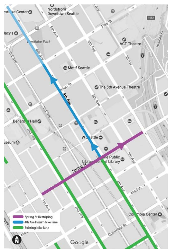
Restriping improvements coming soon to Spring St and 4th Ave

Anticipated Fall 2017: Begin restriping to extend 4th Ave bike lane north of Spring St