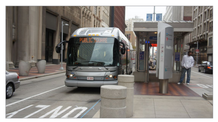
HealthLine, Cleveland, OH

The Madison Street corridor is an opportunity for Seattle to design and implement state-of-the art bus rapid transit (BRT) improvements. The 2.1-mile corridor will run from Colman Dock to 23rd Avenue and will improve access to neighborhoods and employment centers from downtown Seattle to First Hill, Capitol Hill and the Central District. Enhanced east-west connections and transfers to Third Avenue transit, Link light rail, the Center City Connector, and the First Hill streetcar will also expand mobility options beyond the corridor.