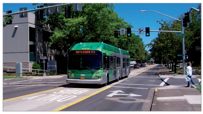
EmX, Eugene, Oregon

The Madison Corridor BRT study will evaluate roadway configuration options, station locations and features, bicycle and pedestrian facilities, and streetscape improvements for the Madison corridor. The process will engage transit agencies, stakeholders, and the broader community to discuss design options and tradeoffs. It will also evaluate implementation options, such as phased transit speed and reliability improvements along with funding opportunities.