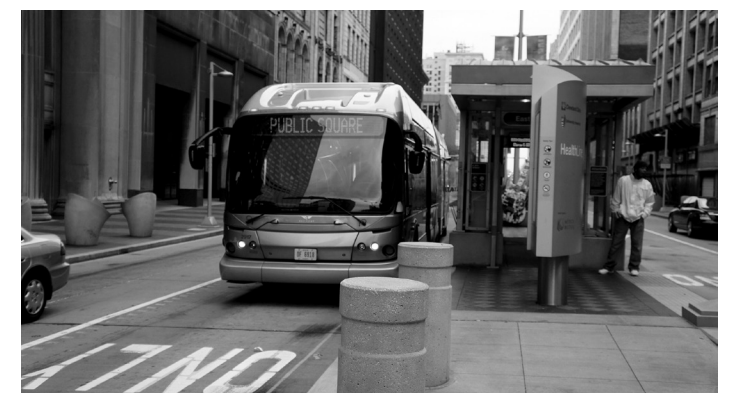
HealthLine, Cleveland, OH

The Madison Corridor BRT study is developing a preferred design concept to make transit service more reliable, frequent, and comfortable along Madison, from the downtown waterfront to Madison Valley. It is also an opportunity to improve the street for those who walk, bike, and visit destinations along Madison.