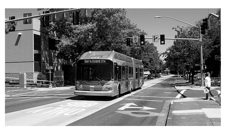
EmX, Eugene, Oregon

These are presented in more detail on the back of this sheet.