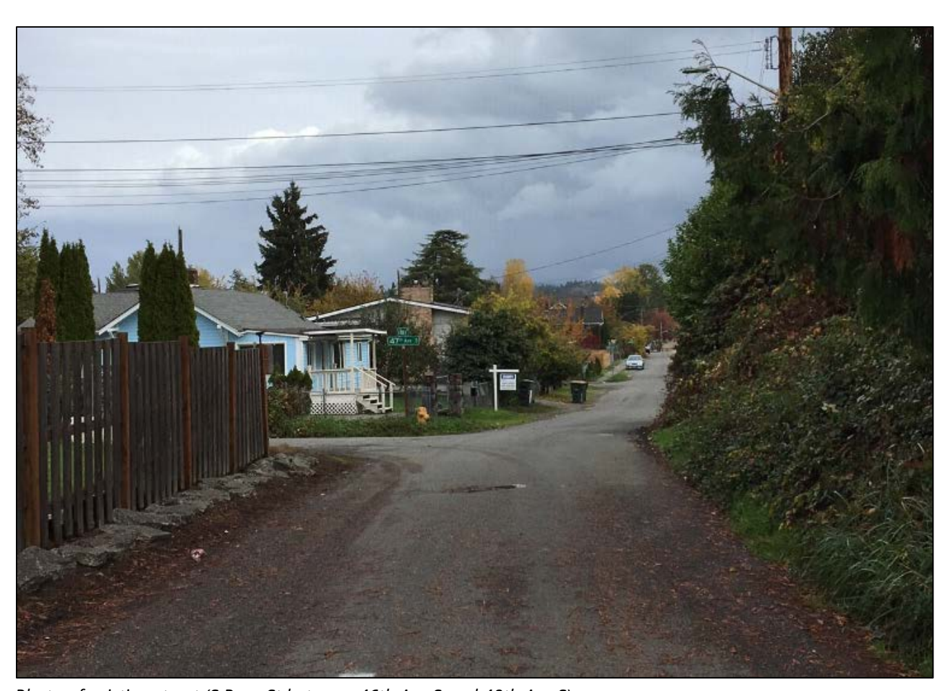
Photo of existing street (S Rose St between 46th Ave S and 48th Ave S)