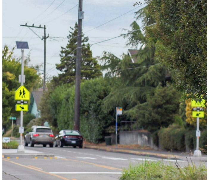
Example of Rectangular Rapid Flashing Beacons (RRFBs)