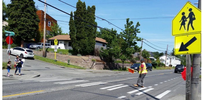
Looking northeast from the southeast corner of the intersection of S Genesee St and Cascadia Ave S