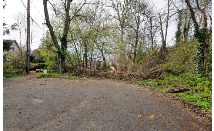
Existing unimproved walkway on 26th Ave SW at SW Trenton St

In 2016, the Chief Sealth High School Walkway project was one of 12 selected by the Levy to Move Seattle Oversight Committee to be funded through SDOT's Neighborhood Street Fund (NSF) program. The NSF program funds projects requested by the community.